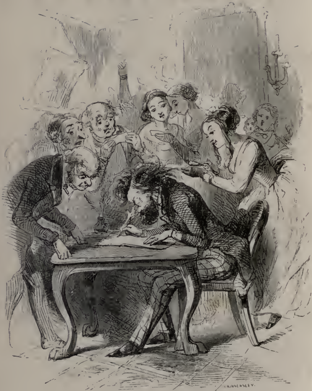
THE LITERARY LION