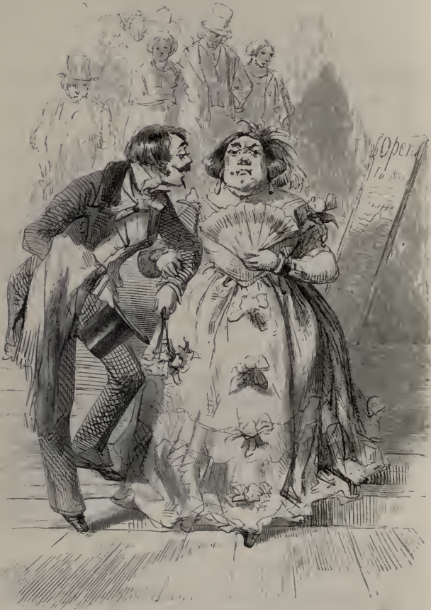
THE TOWN BEAU.