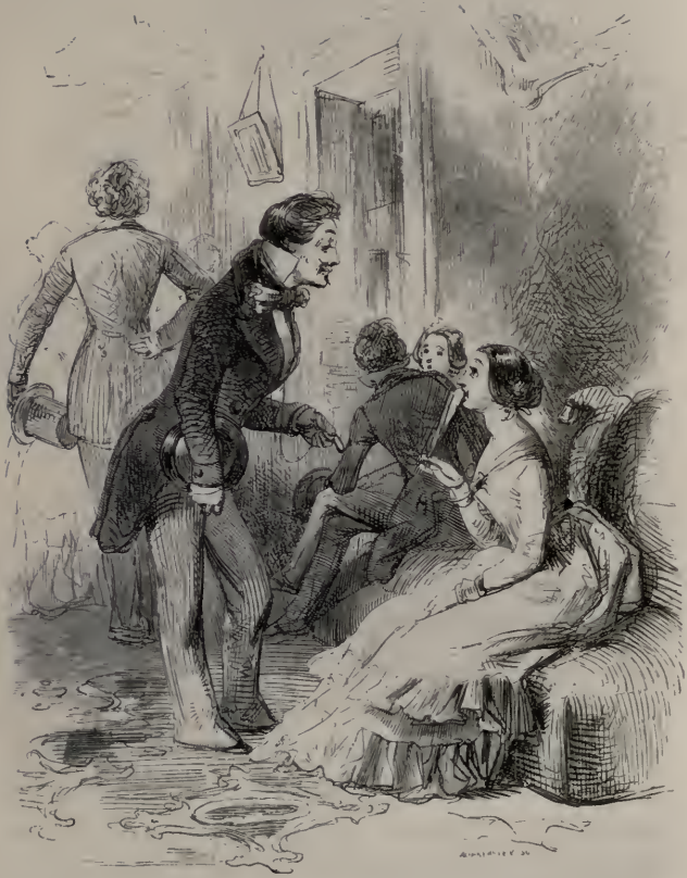
THE FASHIONABLE MAN.