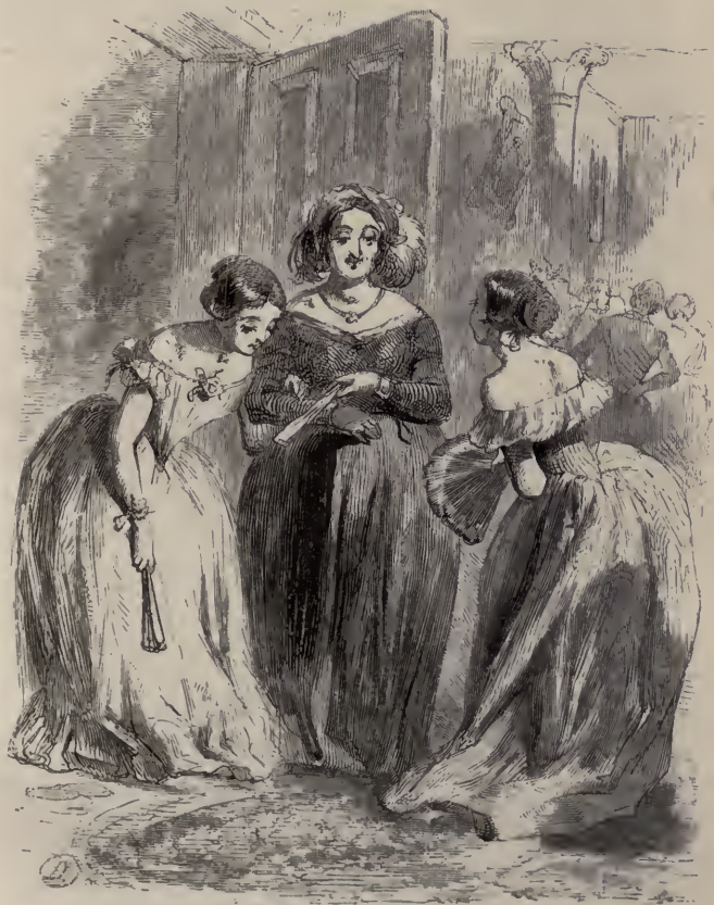
THE LADY IN SOCIETY