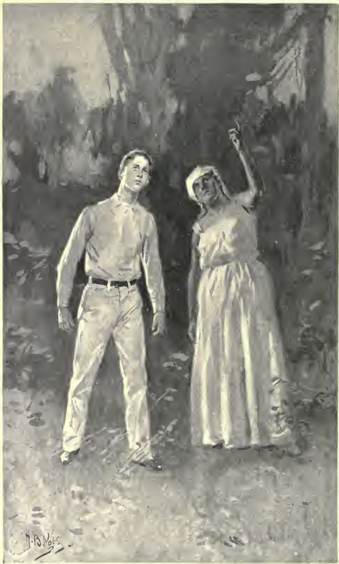
THE MAN AND THE WOMAN IN THE FOREST