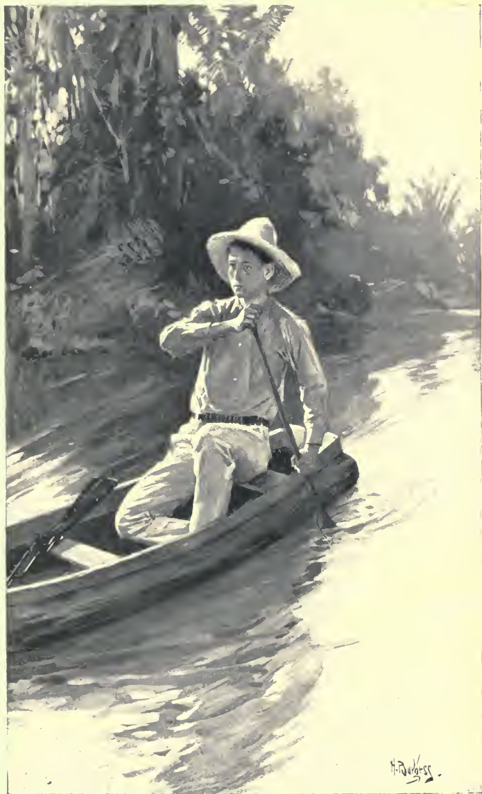
"LE GH LEAPED INTO ONE OF THE MAHOGANY DUGOUT BOATS."