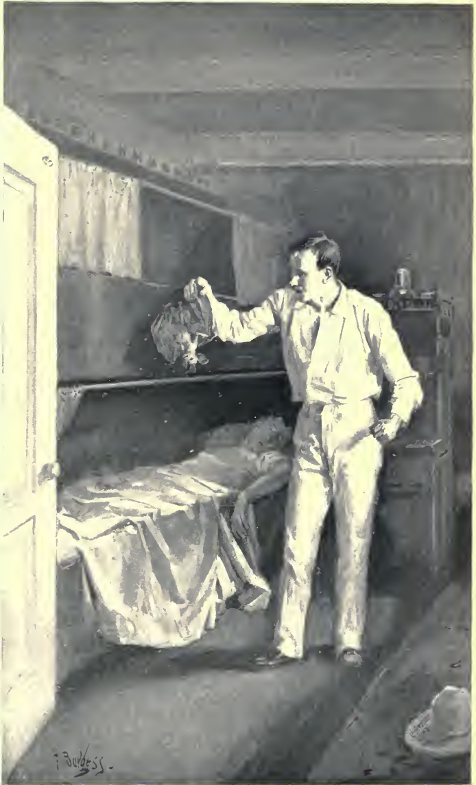
"I FOUND AT THE DEMON-LIKE SPOOKING CREATURE AT WELLS, N.Y. "