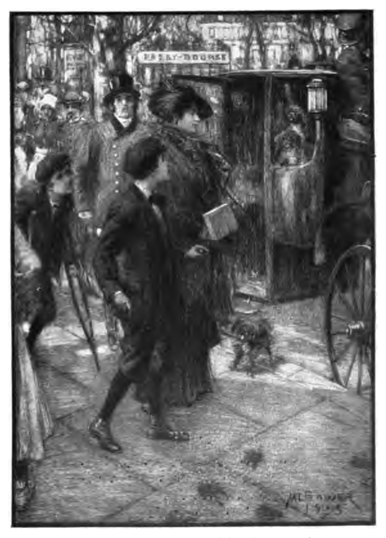
As she moved toward the carriage with him, he spoke a few words in Russian