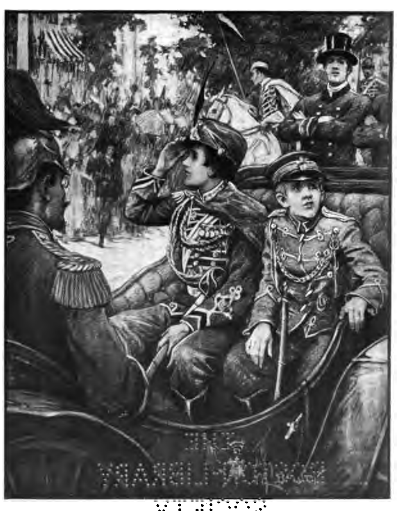
"You must salute too," he said to The Rat