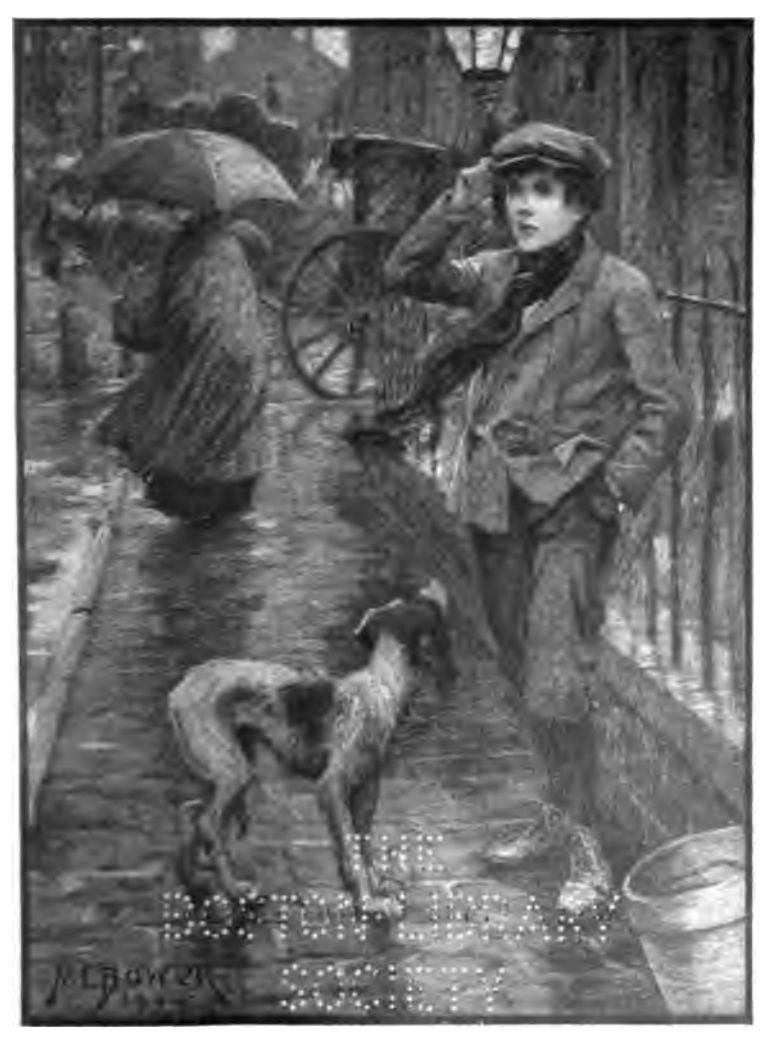
He stood near the iron railings watching the passers-by