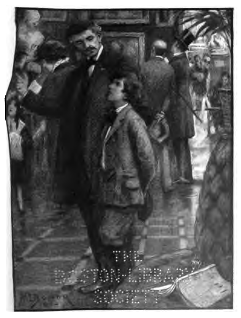
His father made the pictures seem the glowing, burning work of still-living men