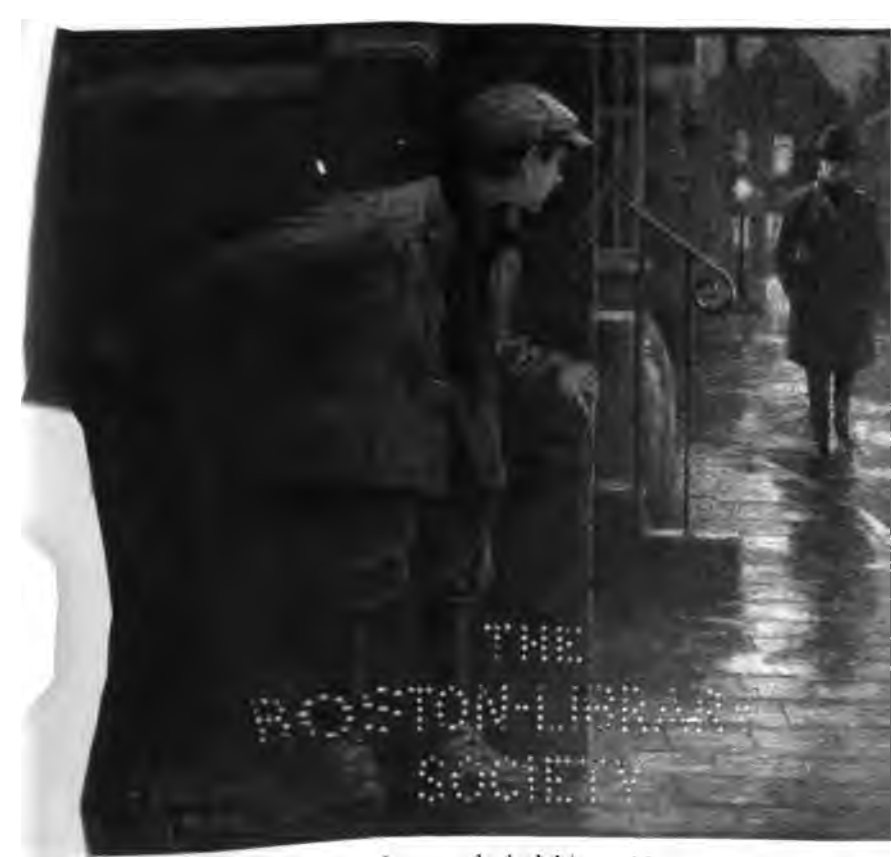
It was the man who had driven with the King!