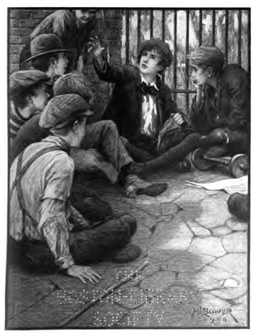
They were suddenly dragged into the world of romance