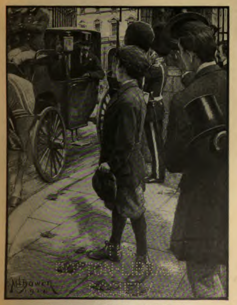
He was the man who had spoken to him in Samavian