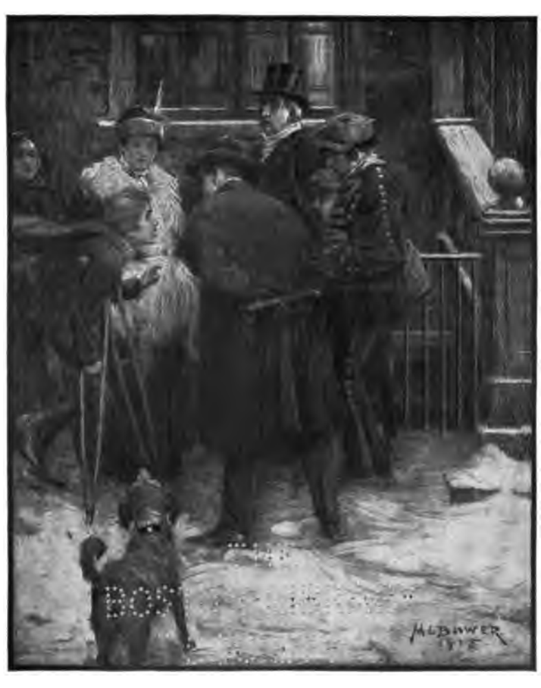
The Rat swung himself into the group. "Where is he!" "Where is he!"