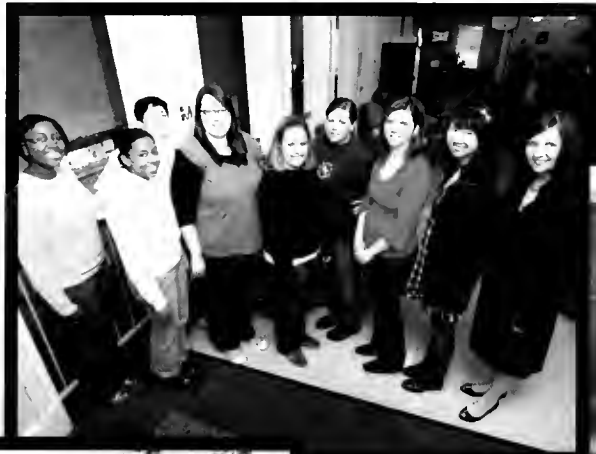
Peanut week 1972