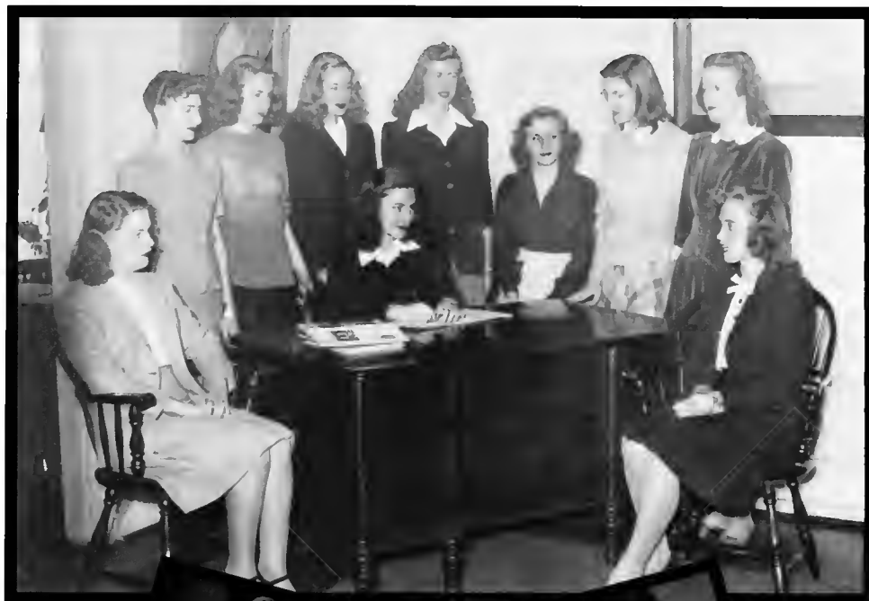
The Lotus Staff, 1945.