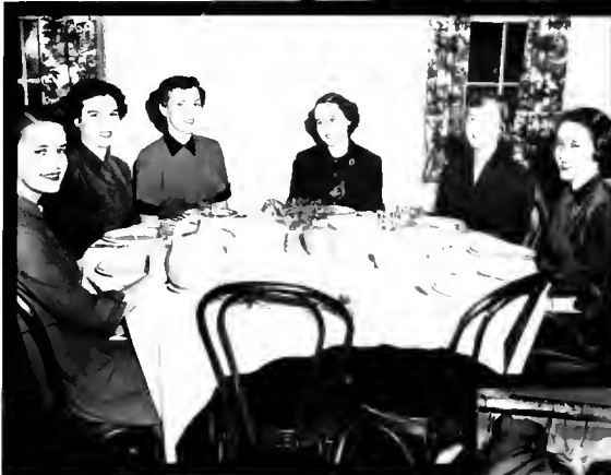
Sigma pi alpha 1952