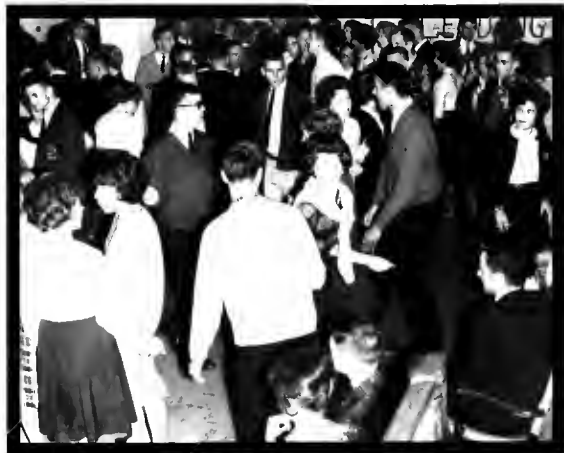
Social Dance, 1962