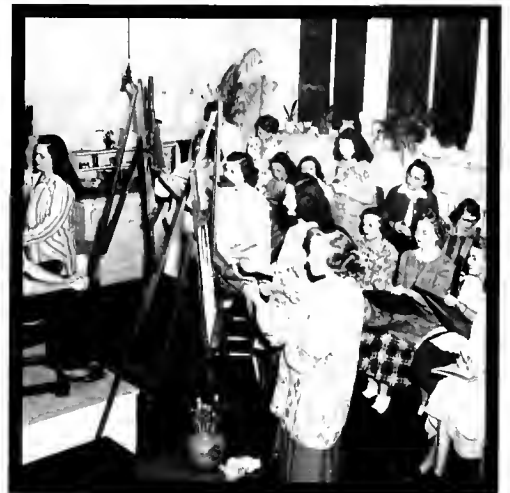
Art Class, 1948.