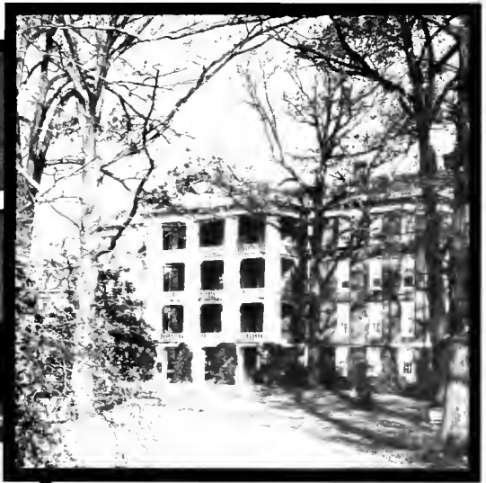
Main Building, 1939