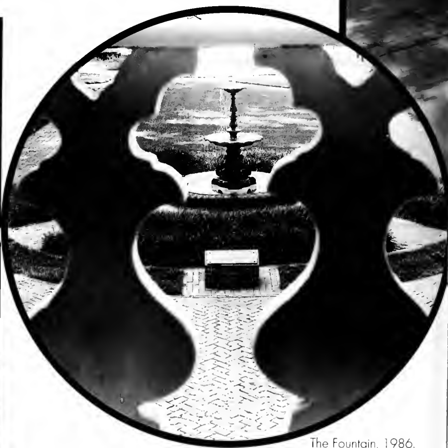
The Fountain, 1986.