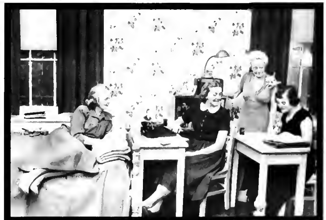
Open House, 1951