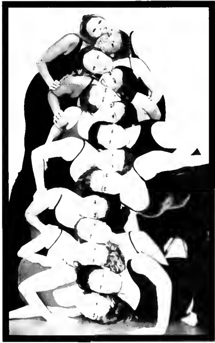
Dance Troupe 1999