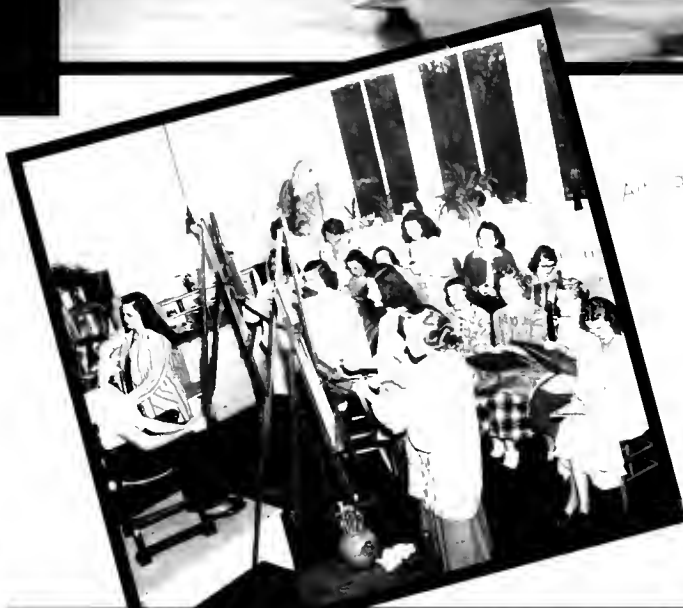
Art 201 248