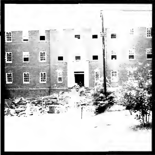
Ross Residence 1969