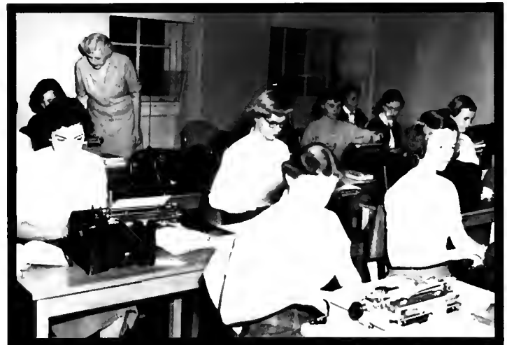
Typing Class, 1950s