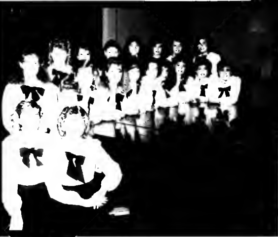
Chamber Singers 1987