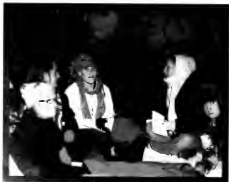
Service is an integral part of the Peace College community