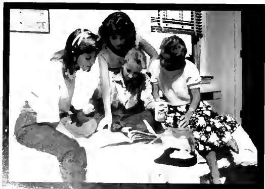
What students are up to...