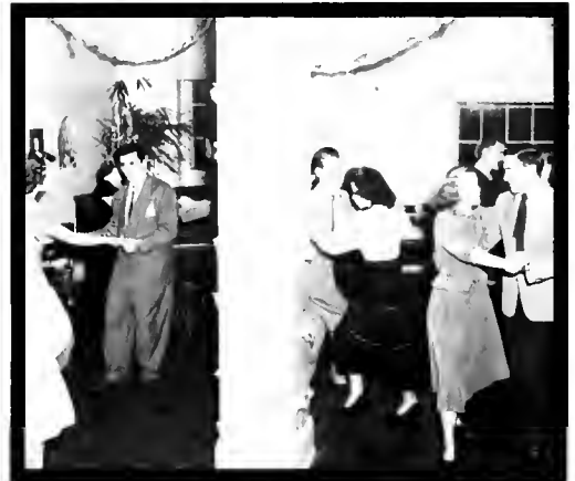
Social Dance, 1949 9