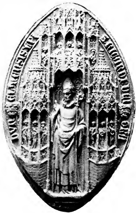
The Seal of Richard de Bury. Bishop of Durham.