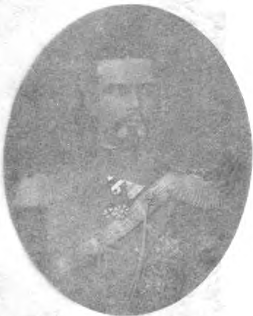
1862 General Sherman