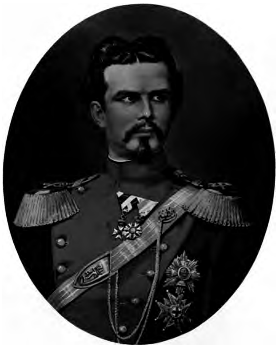
LUDWIG II. KING OF BAVARIA.