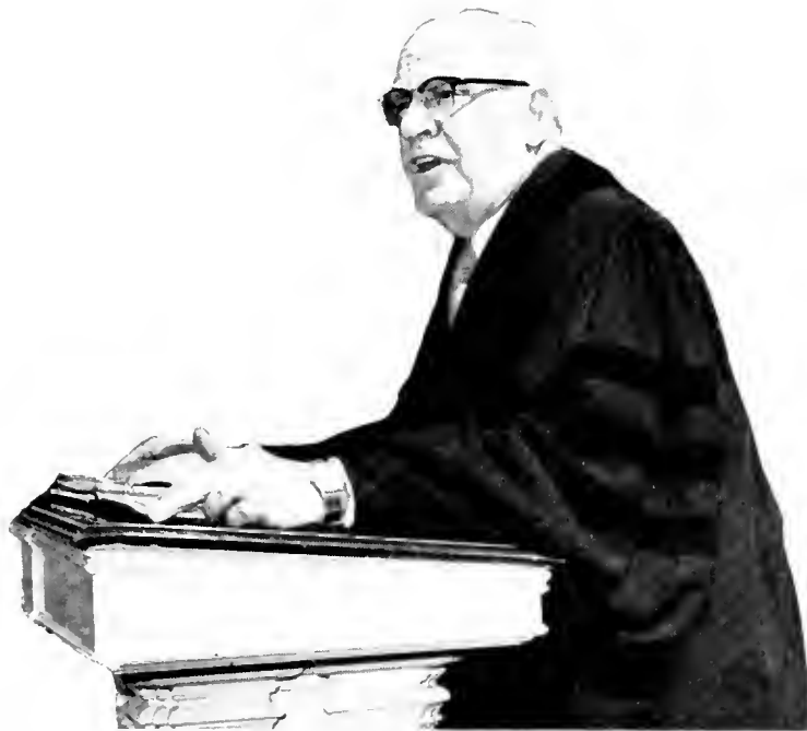
Secretary Hodges delivers Commencement address to Lycoming class of 1961.

Would you say that such unethical practices as price-fixing by our large electrical corporations, false advertising by a number of industries, and excess profits by defense contractors indicate a moral decay in the highest echelons of American business?