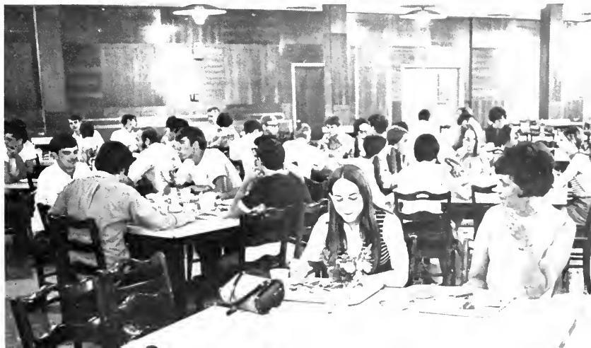
A mother and daughter dine together at a lunch during orientation.