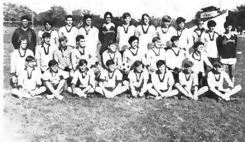
1970 Soccer Squad