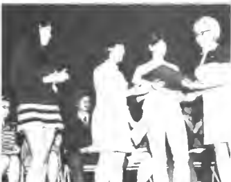
Members of the Lycoming College Honor Society are pictured at a recent meeting.

AN AFTERNOON WORKSHOP will be held by the Lycoming College Board of Trustees on Friday, May 12, at 1 P.M. in the Lycoming Hotel. The workshop will be held in the Lycoming Hotel, 1000 North Washington Street, Williamsport.