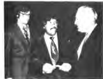
Members of the Lycoming College Honor Society are pictured at a recent meeting.