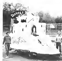
Victoria Finger Congress of African Students