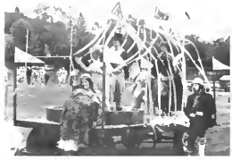
2nd in Place - "First Class World" - Lycoming Band