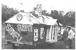
Last - The "Subaru" - Lycoming Band