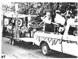
In Place First - Cleveland - Lycoming Band