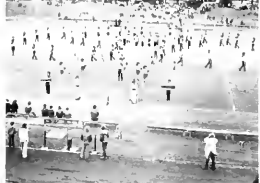
Lycoming High School Band in an outstanding pre-game show