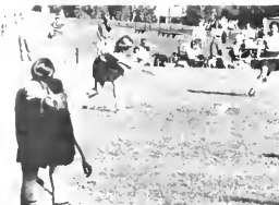
Lycoming players move the ball into position to attack the Scranton goal.

What lies ahead for the Warriors in their drive for the championship and an attempt to match the record 8-1 season compiled by the 1976 team? Western Maryland, Upsala and Dickinson are all formidable foes capable of turning mistakes into a win over the Warriors. A loss to any of the three would obviously prevent the 8-1 season and a defeat by Upsala would probably eliminate the Warriors from the championship race.