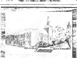
Lycoming College - Lycoming Band