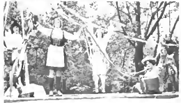
Entertainment - Lycoming Band