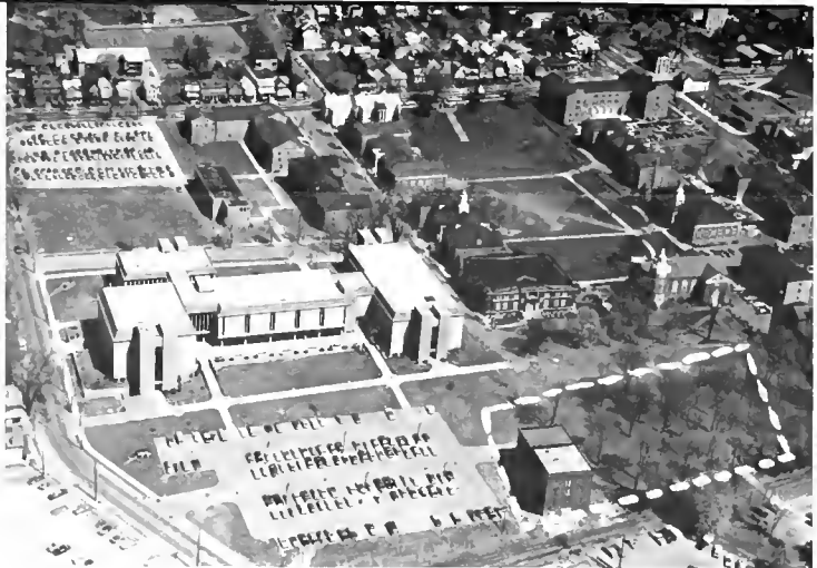
The Angel Factory inside the dotted lines showing the approximate location of the proposed physical education and recreation center will be razed in March in preparation for the construction of the sports complex.

FREDERICK E. BLUMER President of the College