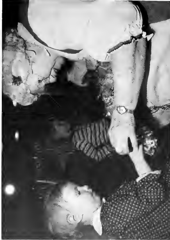
National spotlight on Lycoming Page 1