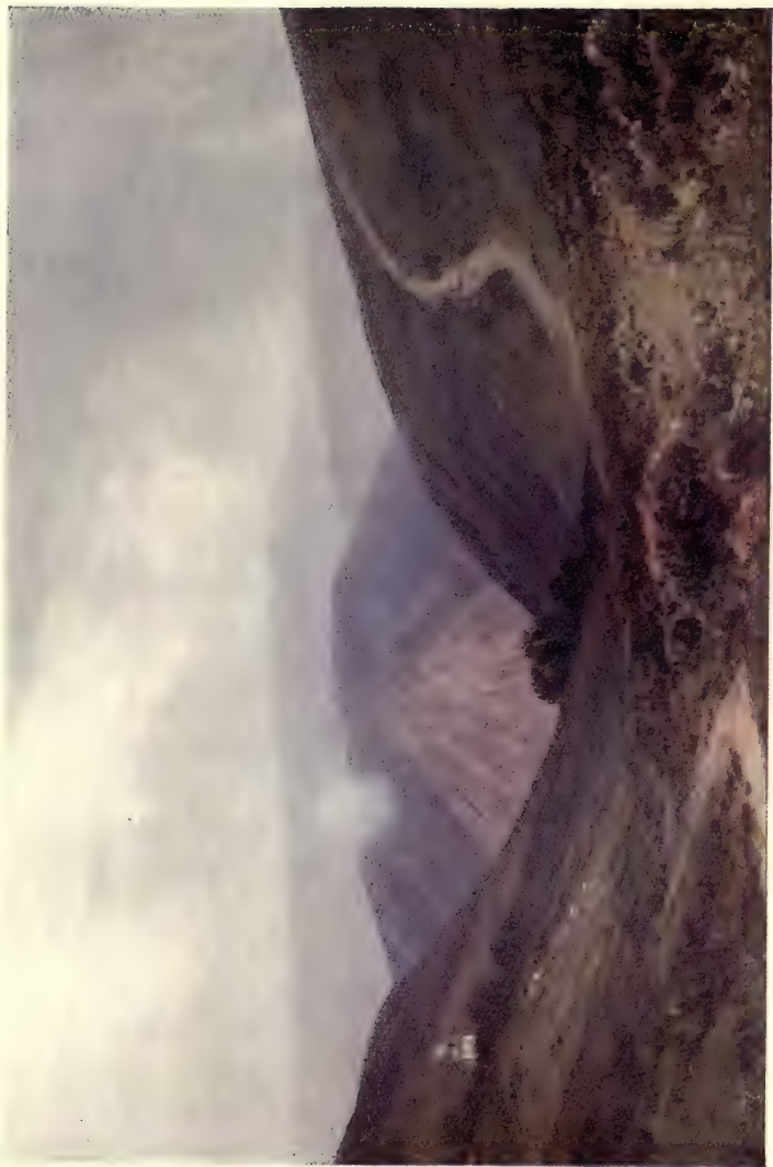
THE SHEPHERD'S COTTAGE, DOONE VALLEY