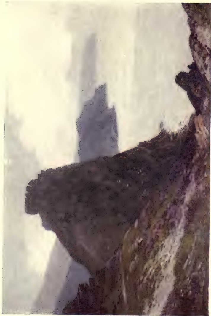
CASTLE ROCK, LYNTON