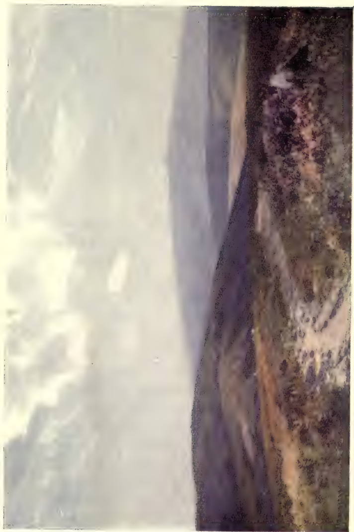
THE MOORS NEAR BRENDON TWO GATES