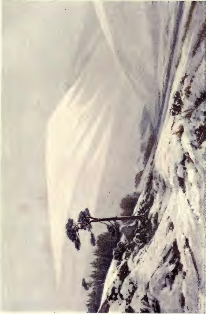
THE DOONE VALLEY IN WINTER