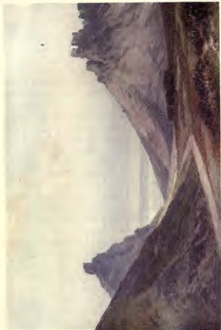
THE VALLEY OF ROCKS