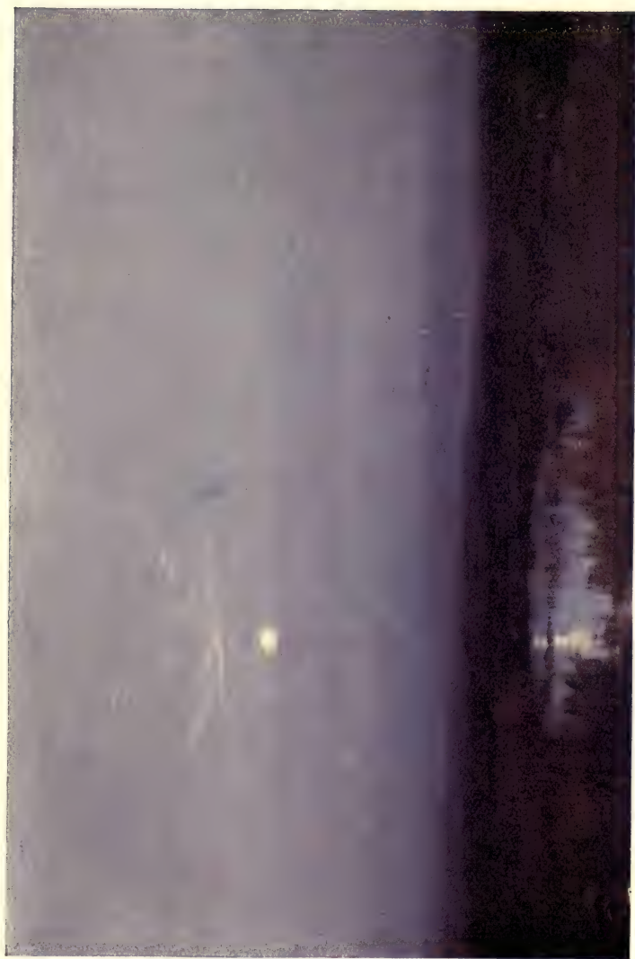
HARVEST MOON, EXMOOR