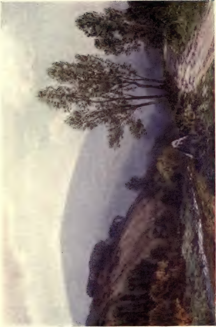
DUNKERY BEACON, FROM HORNER WOODS