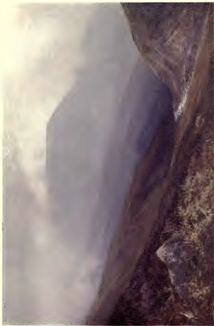
THE DOONE VALLEY