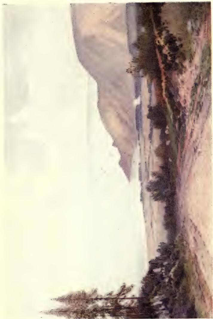
BOSSINGTON HILL FROM PORLOCK HILL