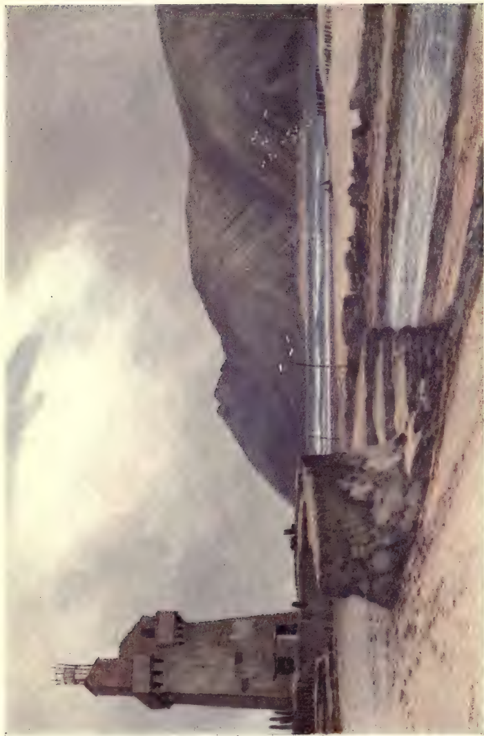
LYNMOUTH BAY AND FORELAND