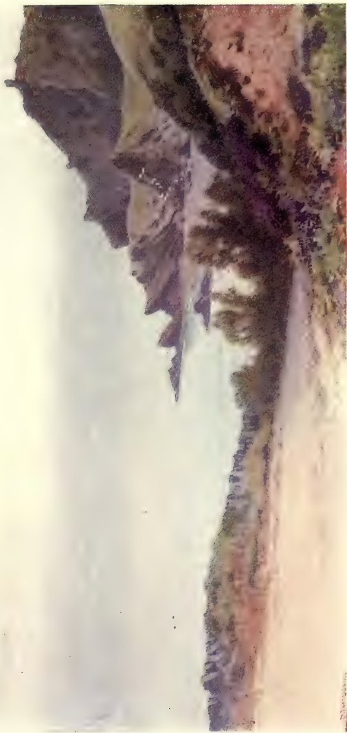
WOOLLY BAY AND DUTY POINT, WEST LYNTON