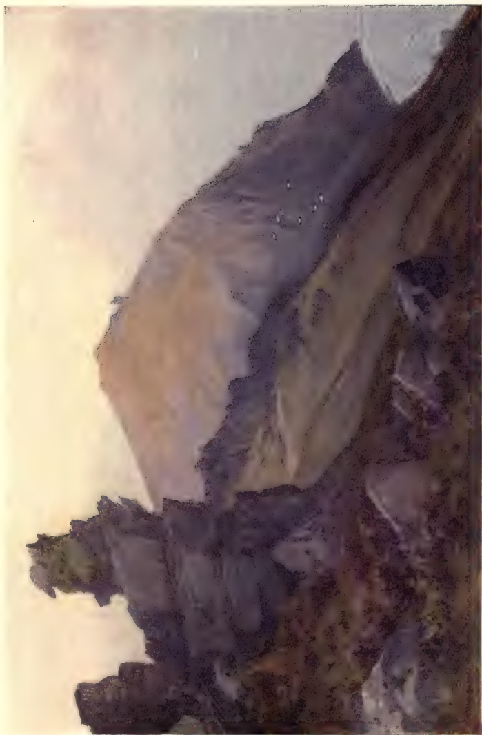
LANTON: THE DEVIL'S CHEESERING