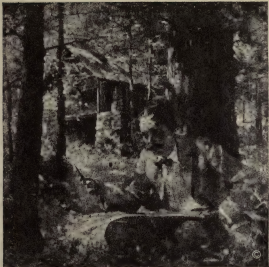
MacDowell Composing his "Woodland Sketches"