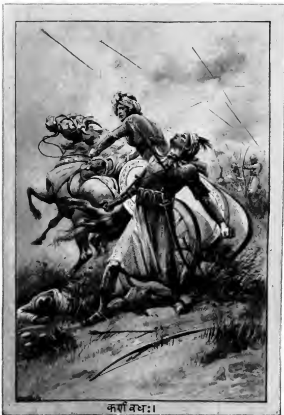
Full of Karma.