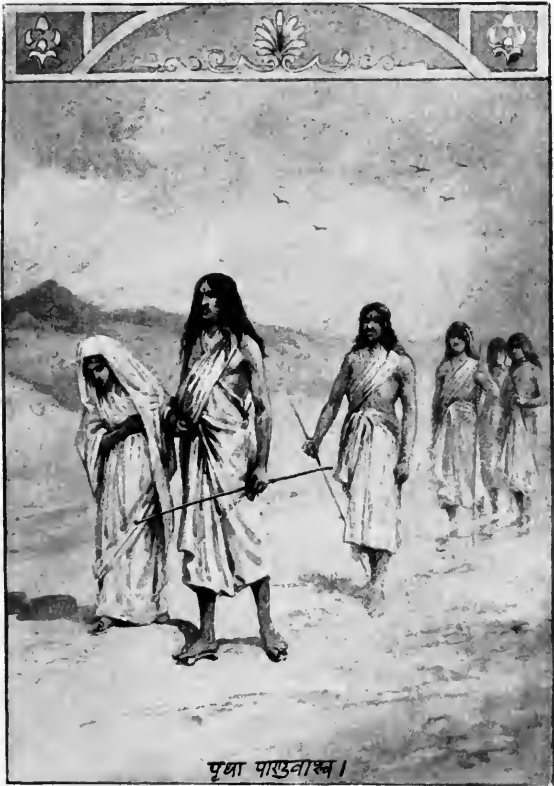
Pandavs journeying with their mother.