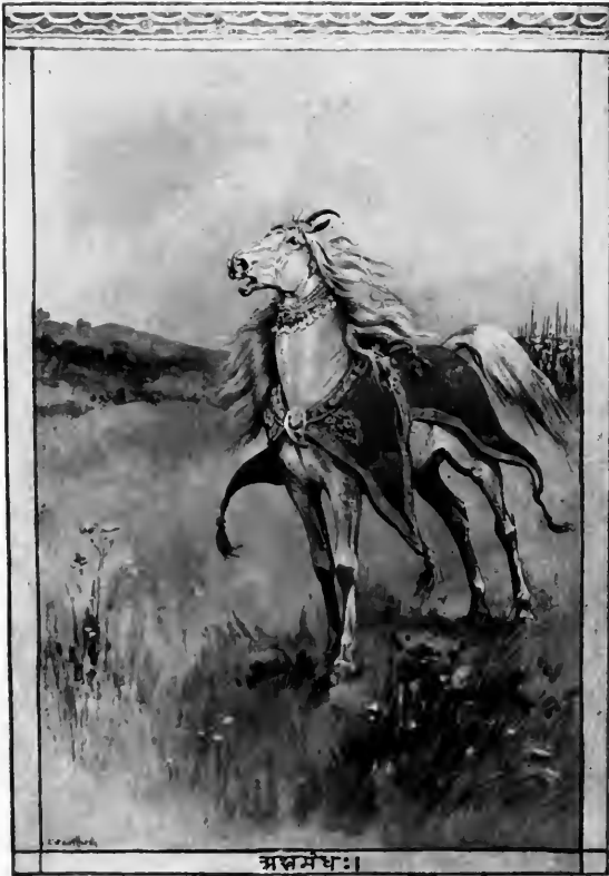
Return of the Sacrificial Horse.