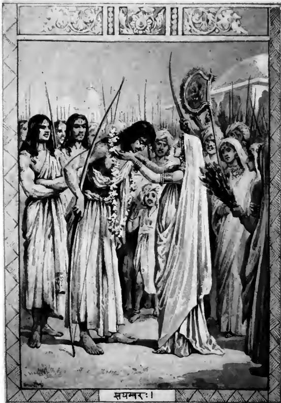
The Bride's Choice.