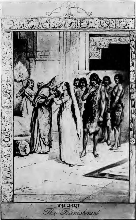
वनगमनम् The Banishment