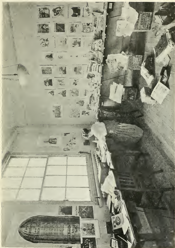
NEWSPAPERS IN VARIOUS LANGUAGES PUBLISHED OR INSPIRED BY GERMANY.