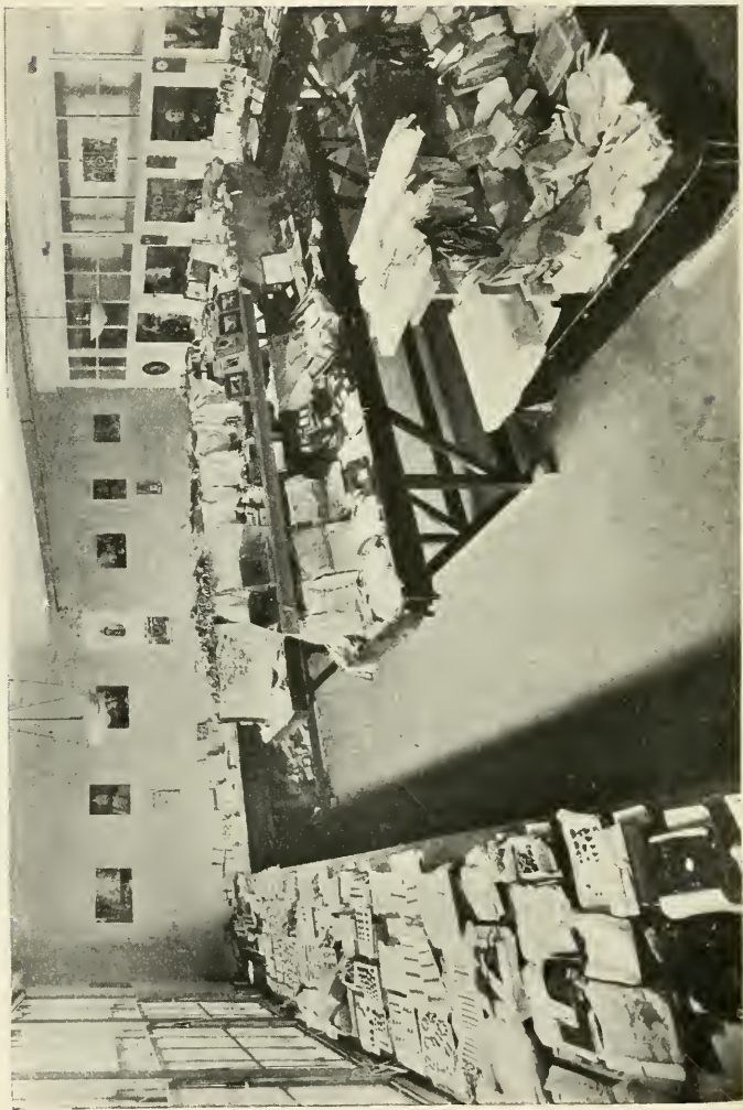
THE CENSOR'S MUSEUM.

Another view, showing rubber in foreground.