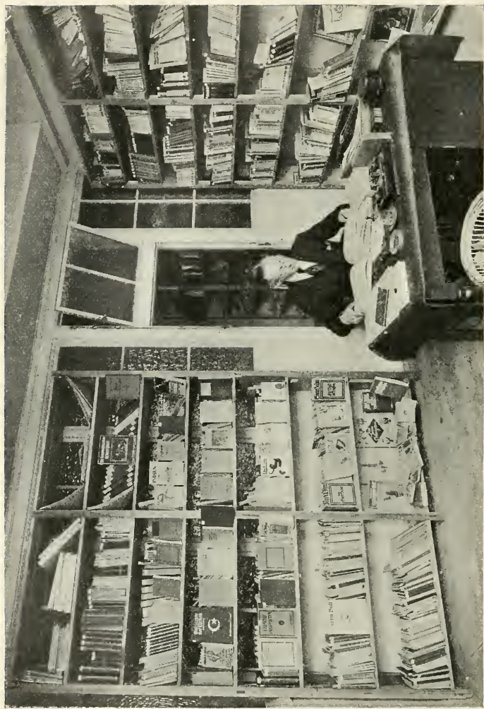
POSTAL CENSORSHIP LIBRARY. With specimens of German propagandist literature.