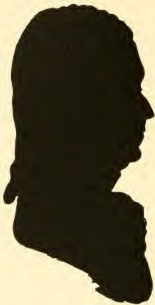
GEN. PELEG WADSWORTH.