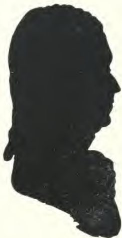
GEN. PELEG WADSWORTH.