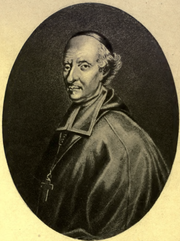
Francoisvesgus De Quebec