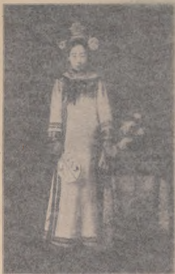
A MANCHURIAN GIRL