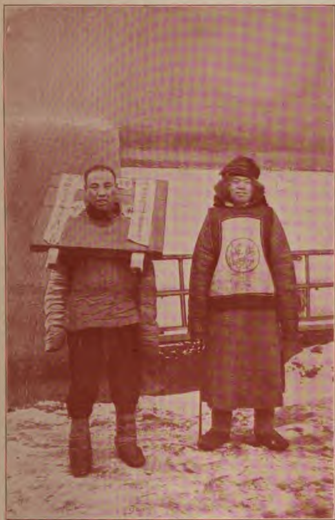
A MANCHURIAN CRIMINAL