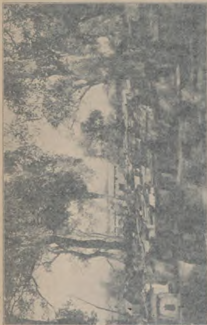
TEMPORARY STORAGE OF THE COFFINS OF DEAD CHINESE AWAITING TRANSPORTATION TO THE ORIGINAL HOMES OF THE DECEASED