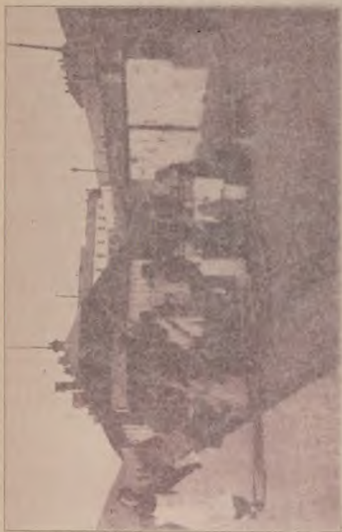
THE BUREAU OF THE ARMY, WASHINGTON, D. C.