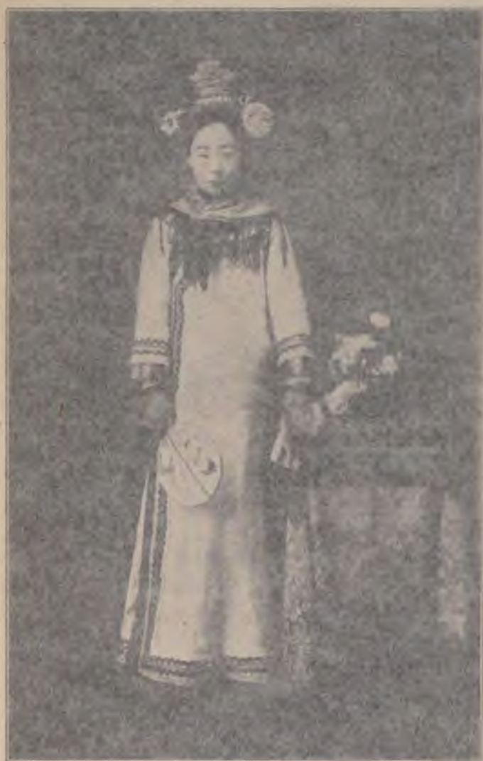
A MANCHURIAN GIRL