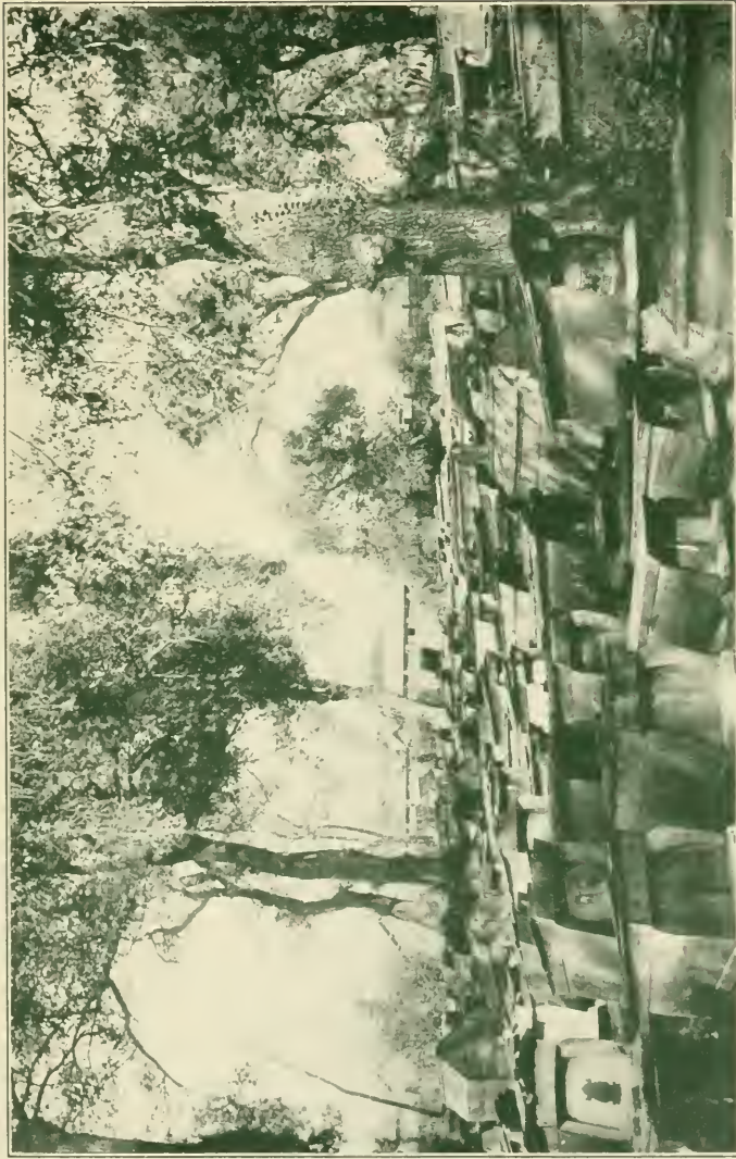
TEMPORARY STORAGE OF THE COFFINS OF DEAD CHINESE AWAITING TRANSPORTATION TO THE ORIGINAL HOMES OF THE DECEASED