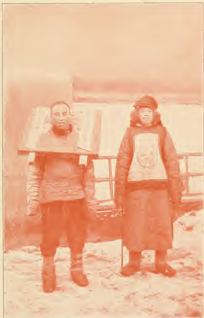
A MANCHURIAN CRIMINAL