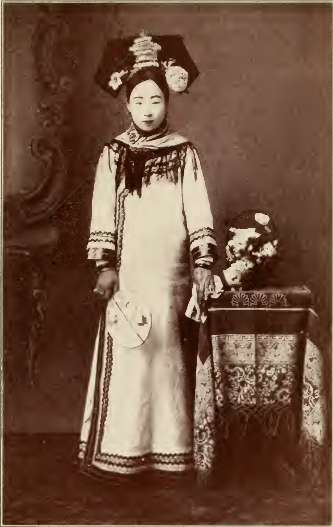
A MANCHURIAN GIRL