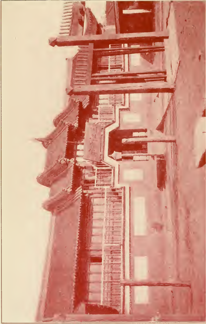
CHINESE BUILDING UTILISED AS RUSSIAN OFFICERS QUARTERS AT NIU-CHWANG