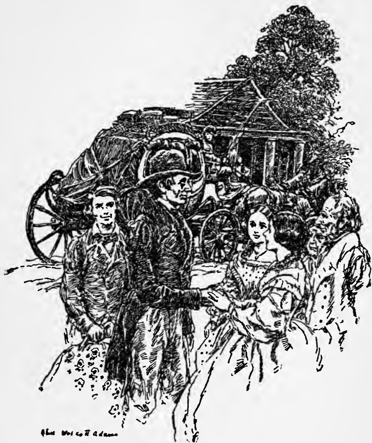
The Wicket Gate