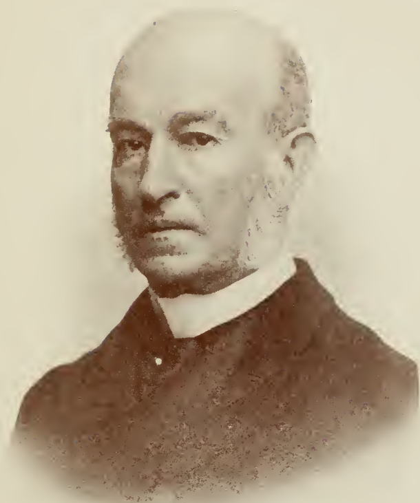
DARIUS OGDEN MILLS