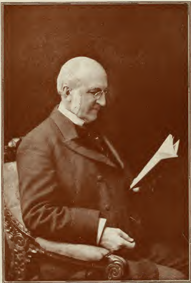
Chauncey M. Depew.