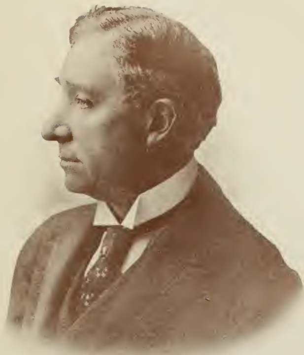
WILLIAM BOURKE COCKRAN