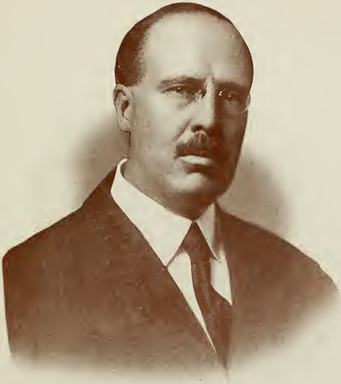
WILLIAM TEMPLE EMMET