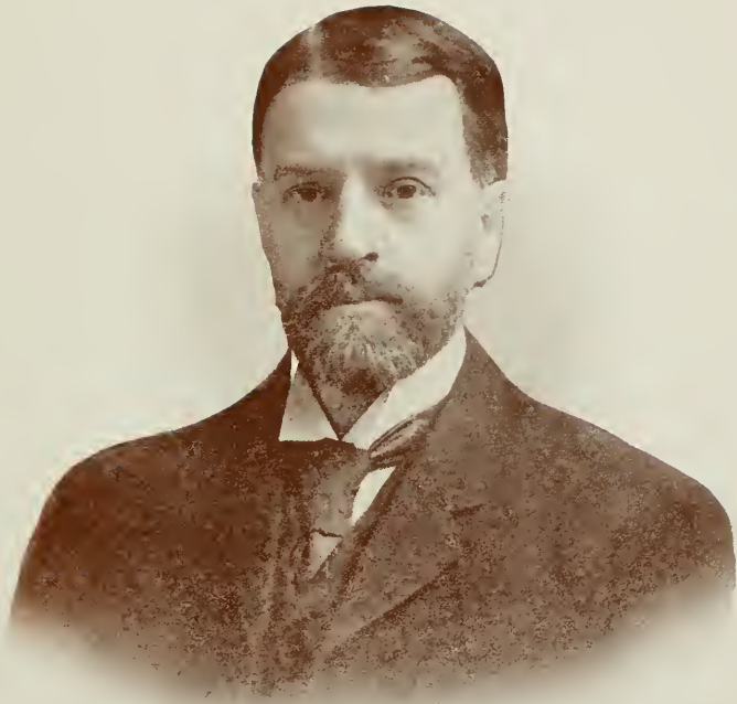
WILLIAM B. GREELEY