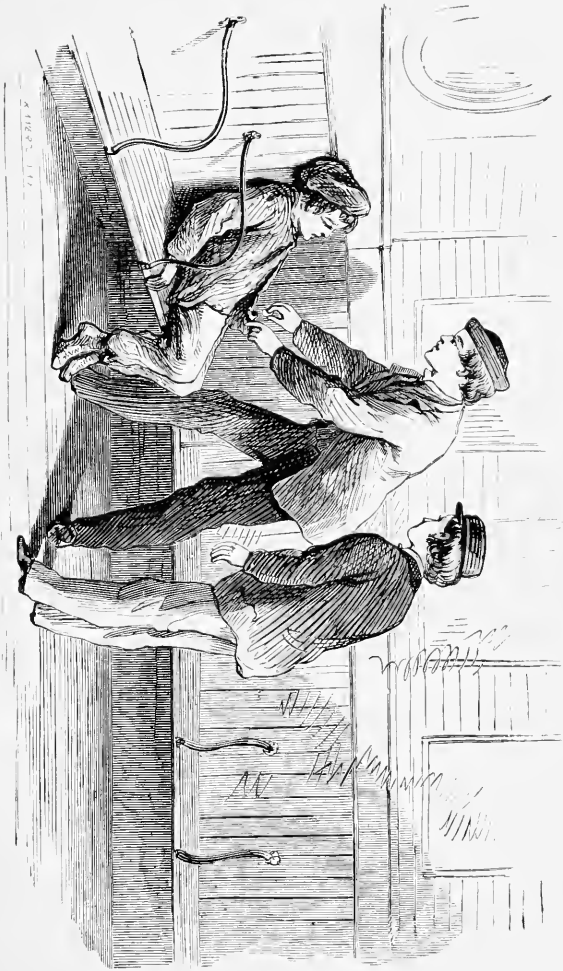
DICK AS A PHILANTHROPIST.