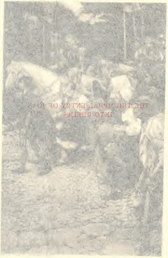
THE TRIUMPHAL ENTRY OF JOAN INTO RHEIMS