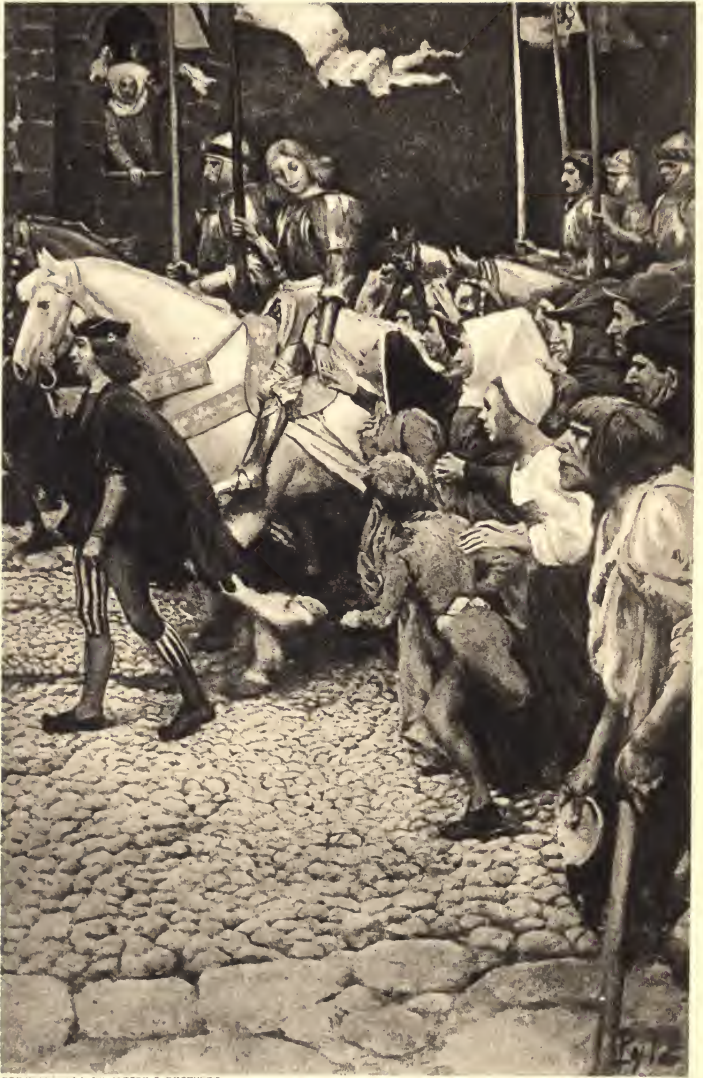
DRYDEN & BARNETT BY HARPER & BROTHERS