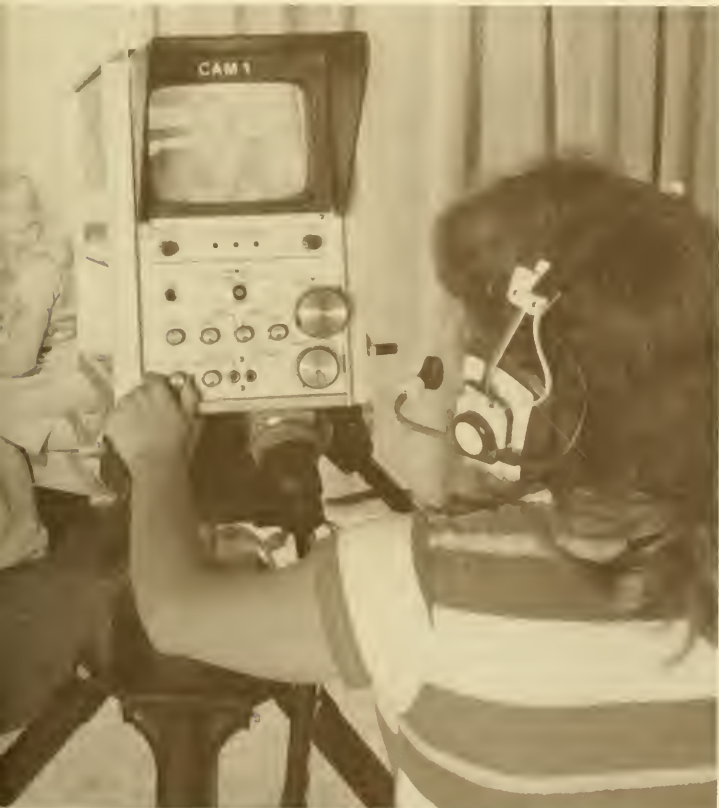
Going in for a close-up during an interview in a "talk show" format