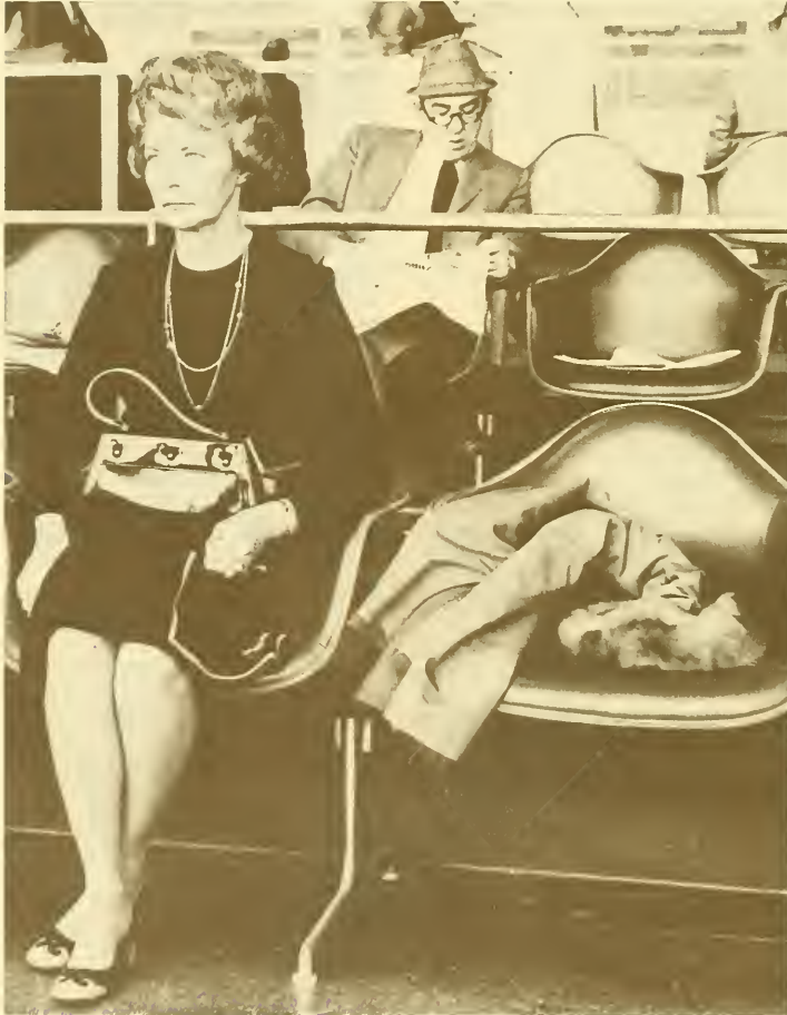
"I think the shot of the woman in the airport is the best thing I've ever done."