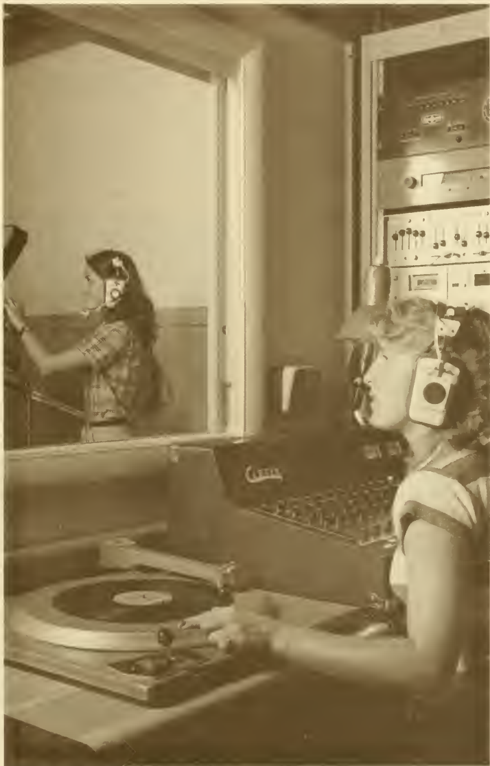
A student cues the turntable to bring the music "under" during production.

Learning the fundamentals of composition and television procedures is only one aspect of the challenge facing students. A new vocabulary must be mastered. "Gen-lock," "sync," "pedestal,"