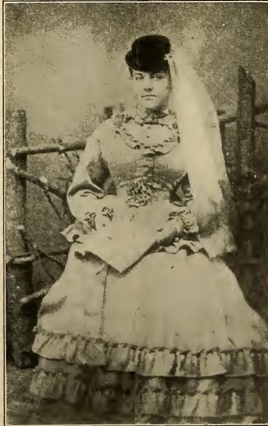
THE FIRST MARY BALDWIN UNIFORM 1878

The Purpose of the Mary Baldwin News Letter is to inform all Mary Baldwin girls of what the College, the Alumnæ Association, and its members are doing