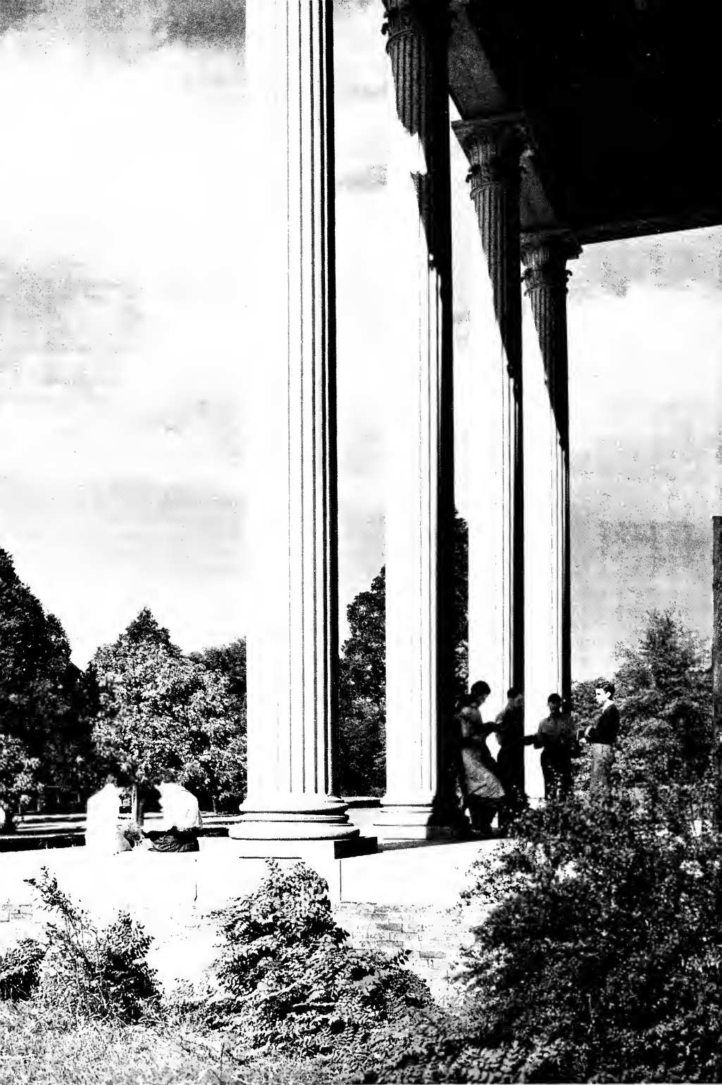
THE PILLARS OF THAW HALL