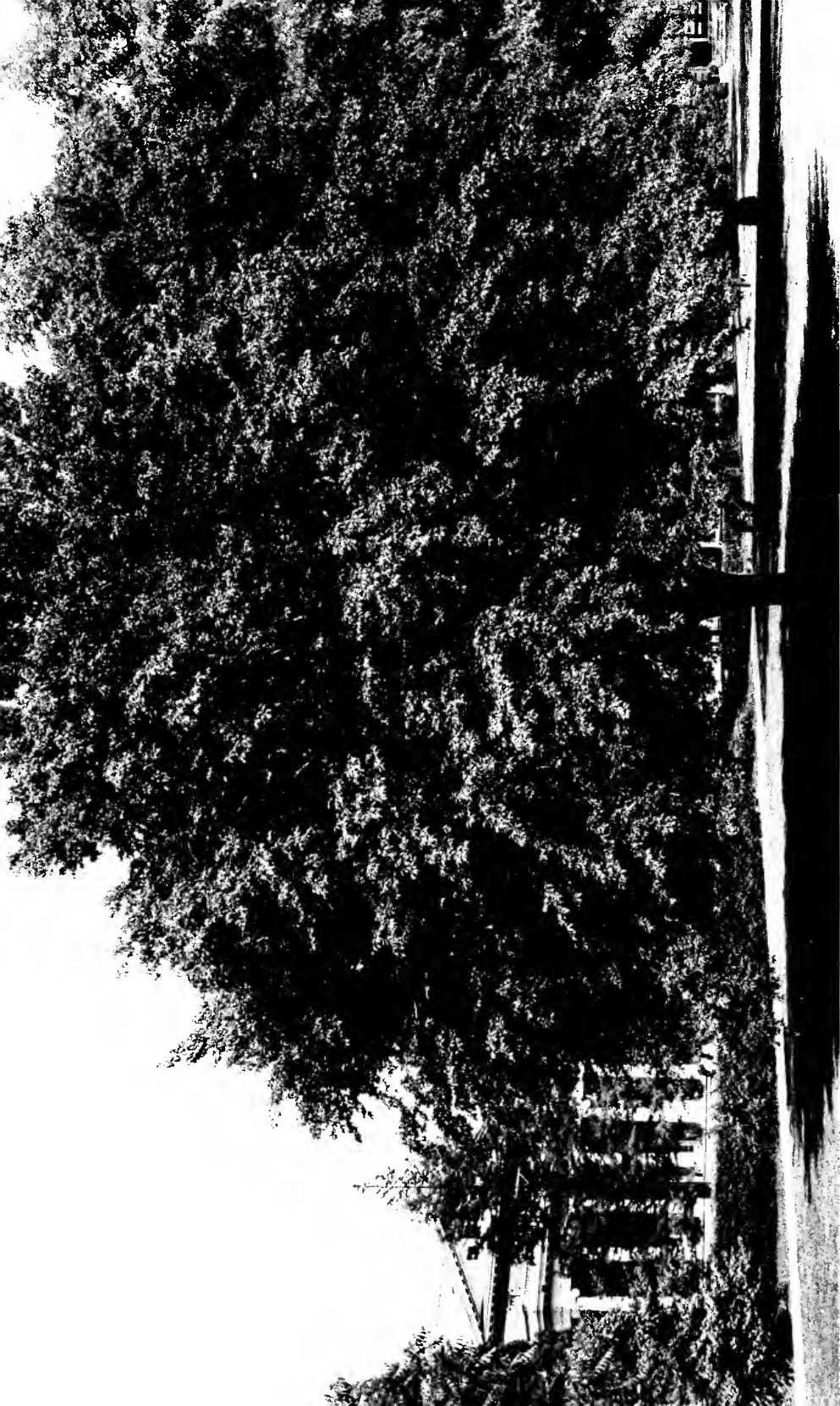
NEAR THE CENTER OF THE CAMPUS