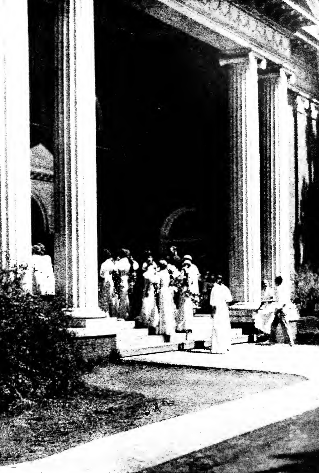
A GLIMPSE OF THE CHAPEL ON COMMENCEMENT DAY