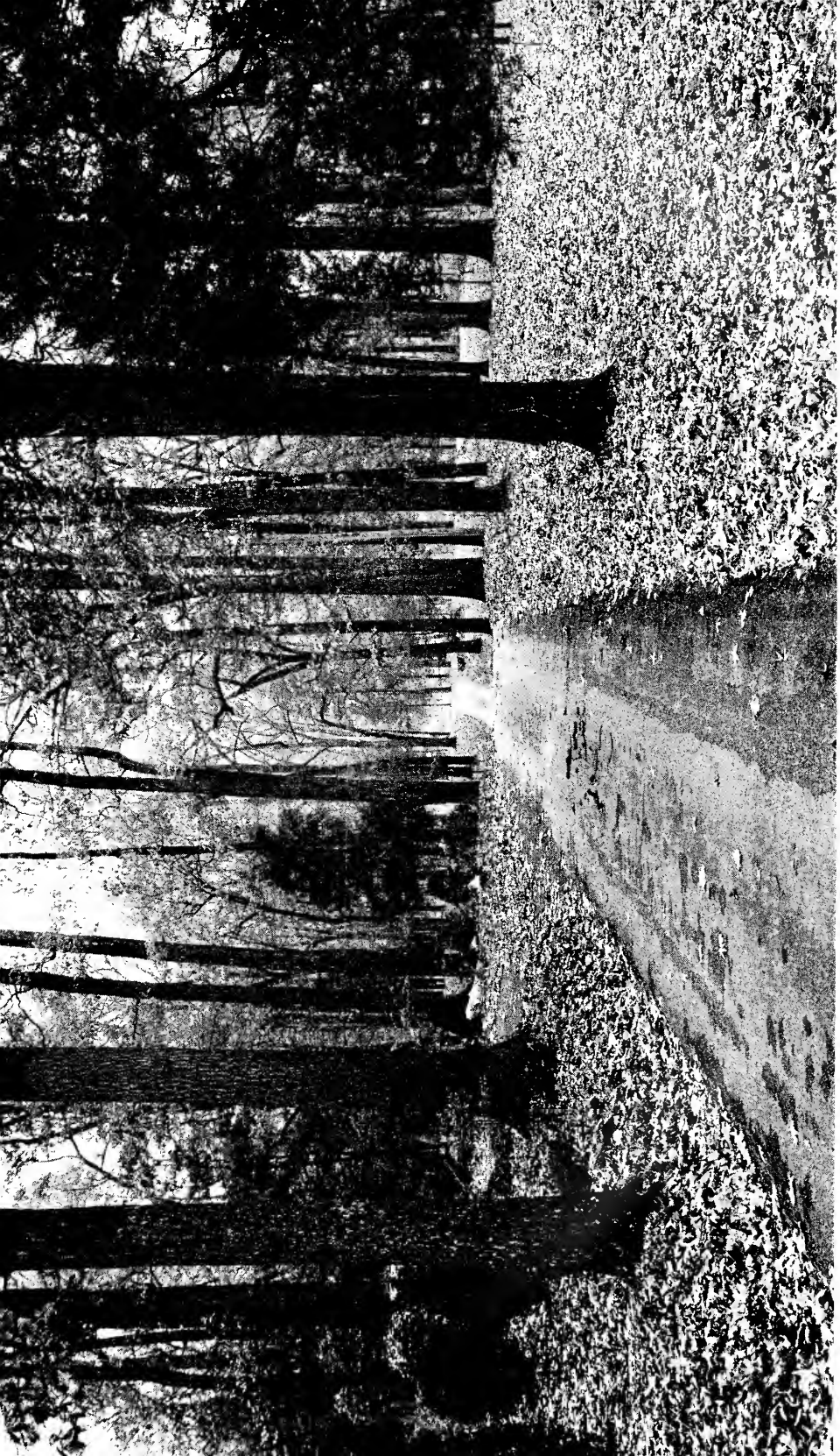
IN THE COLLEGE WOODS