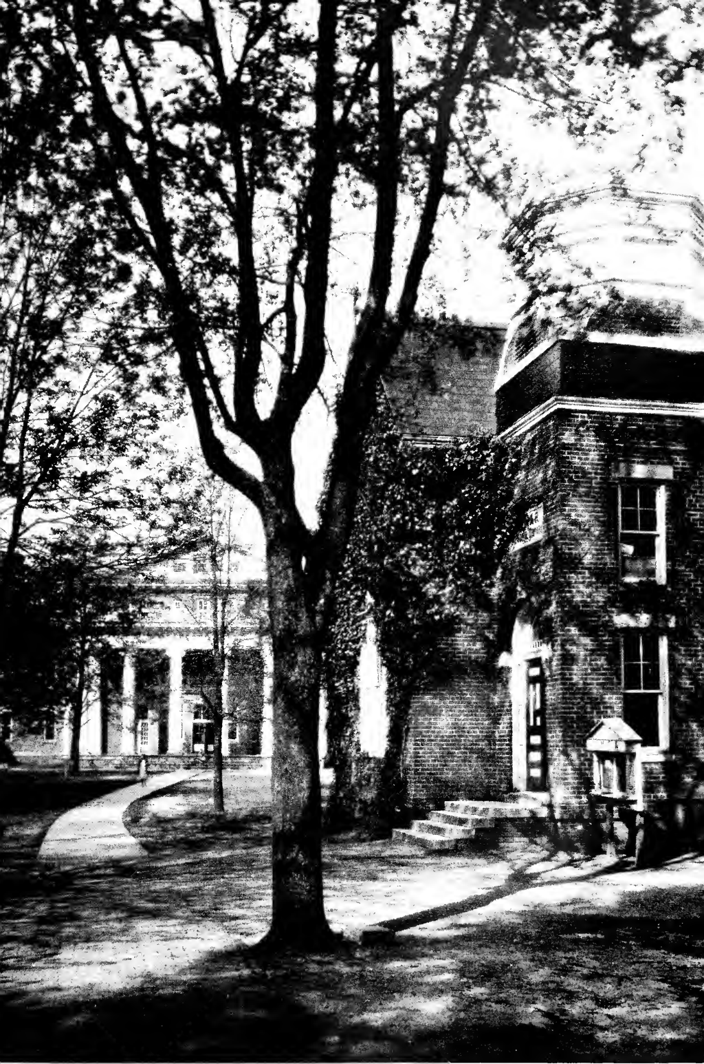
FROM THE BOOKSTORE TO PEARSONS HALL