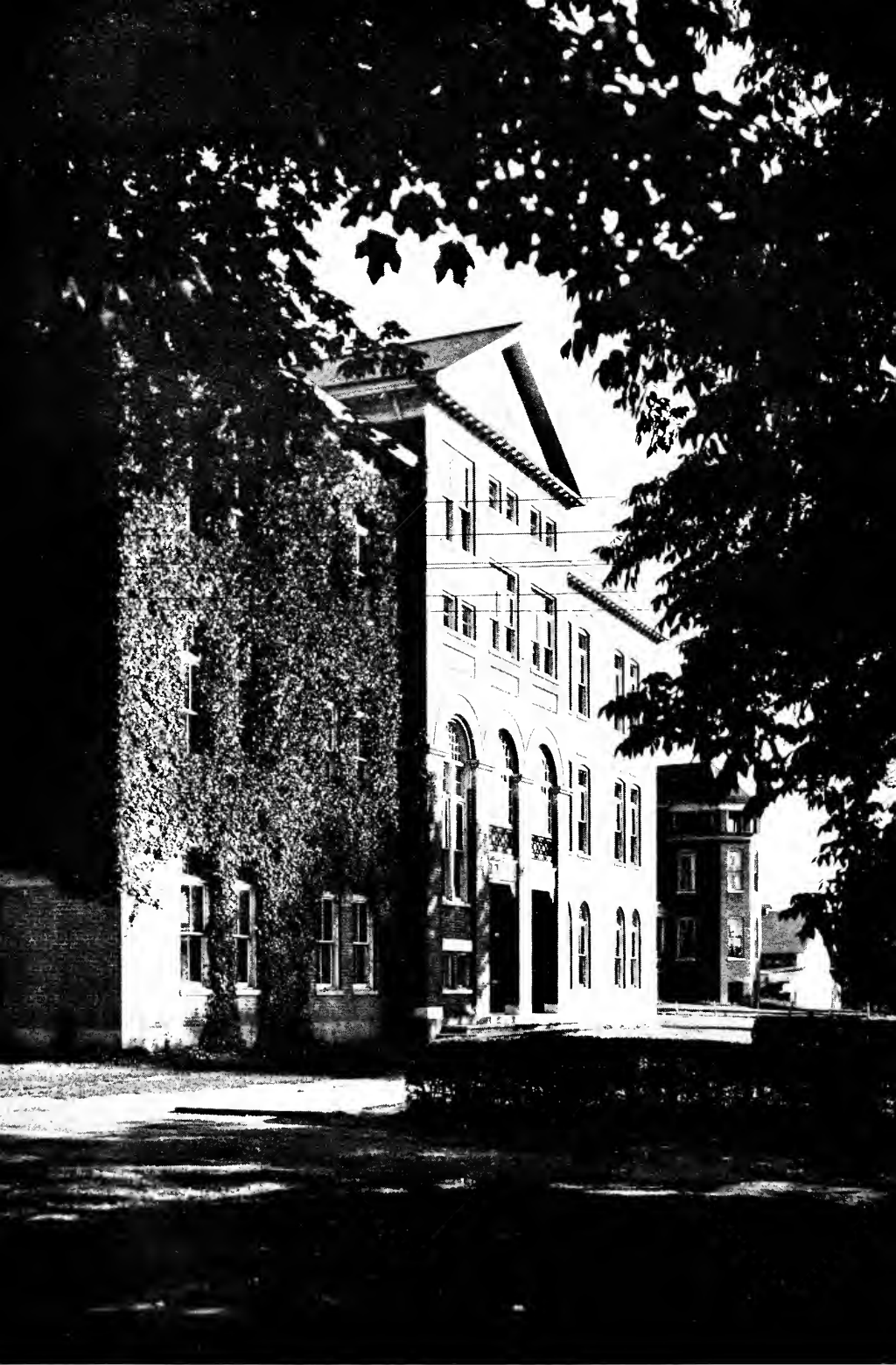
FAYERWEATHER SCIENCE HALL, WITH BARTLETT AND ALUMNI GYMNASIUM BEYOND