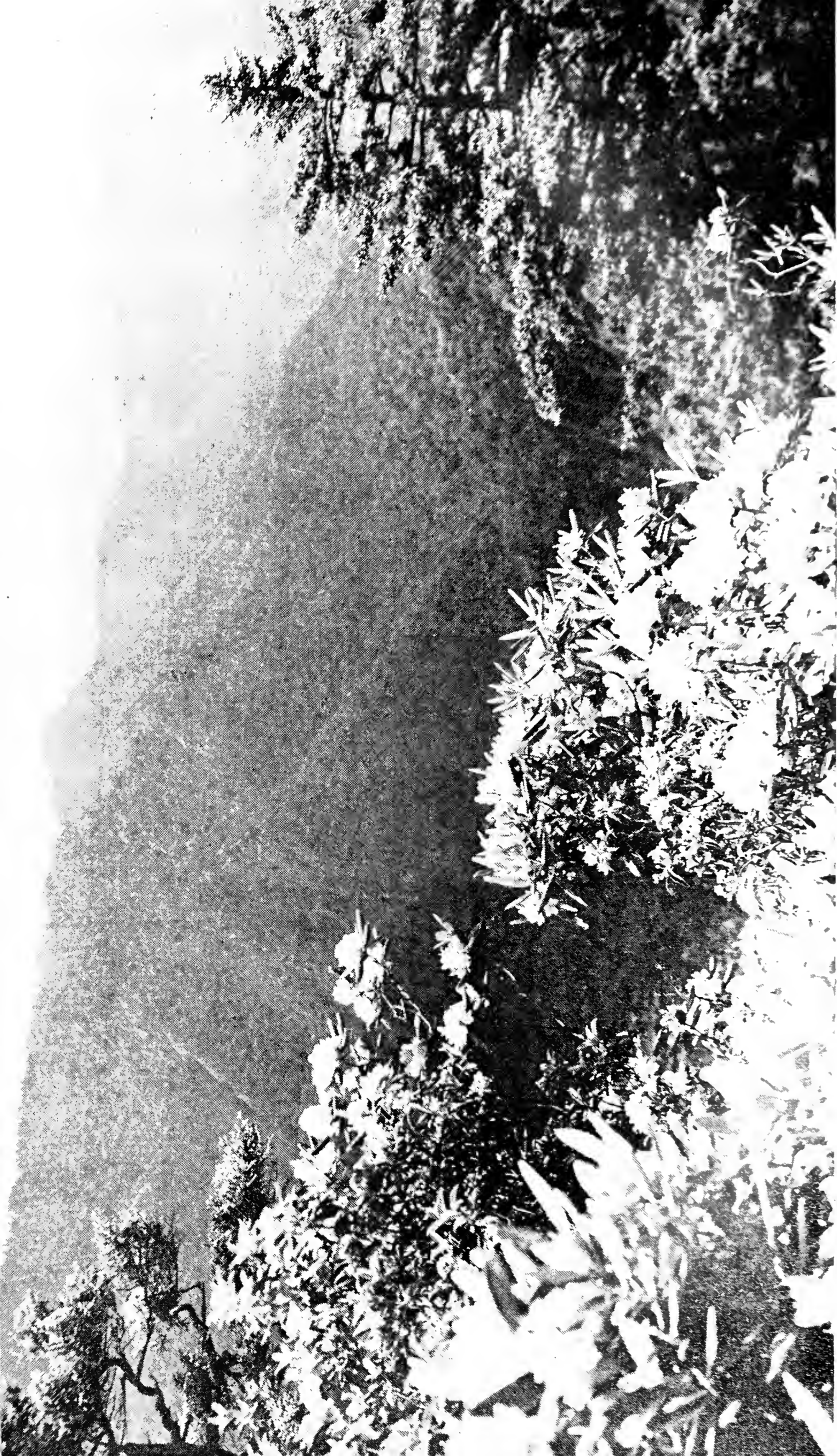
IN THE GREAT SMOKY MOUNTAINS NATIONAL PARK