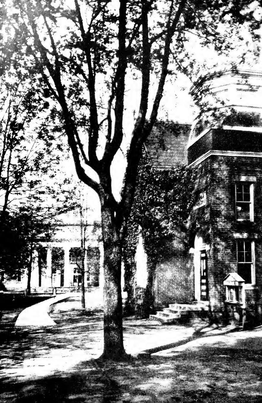
FROM THE BOOKSTORE TO PEARSONS HALL