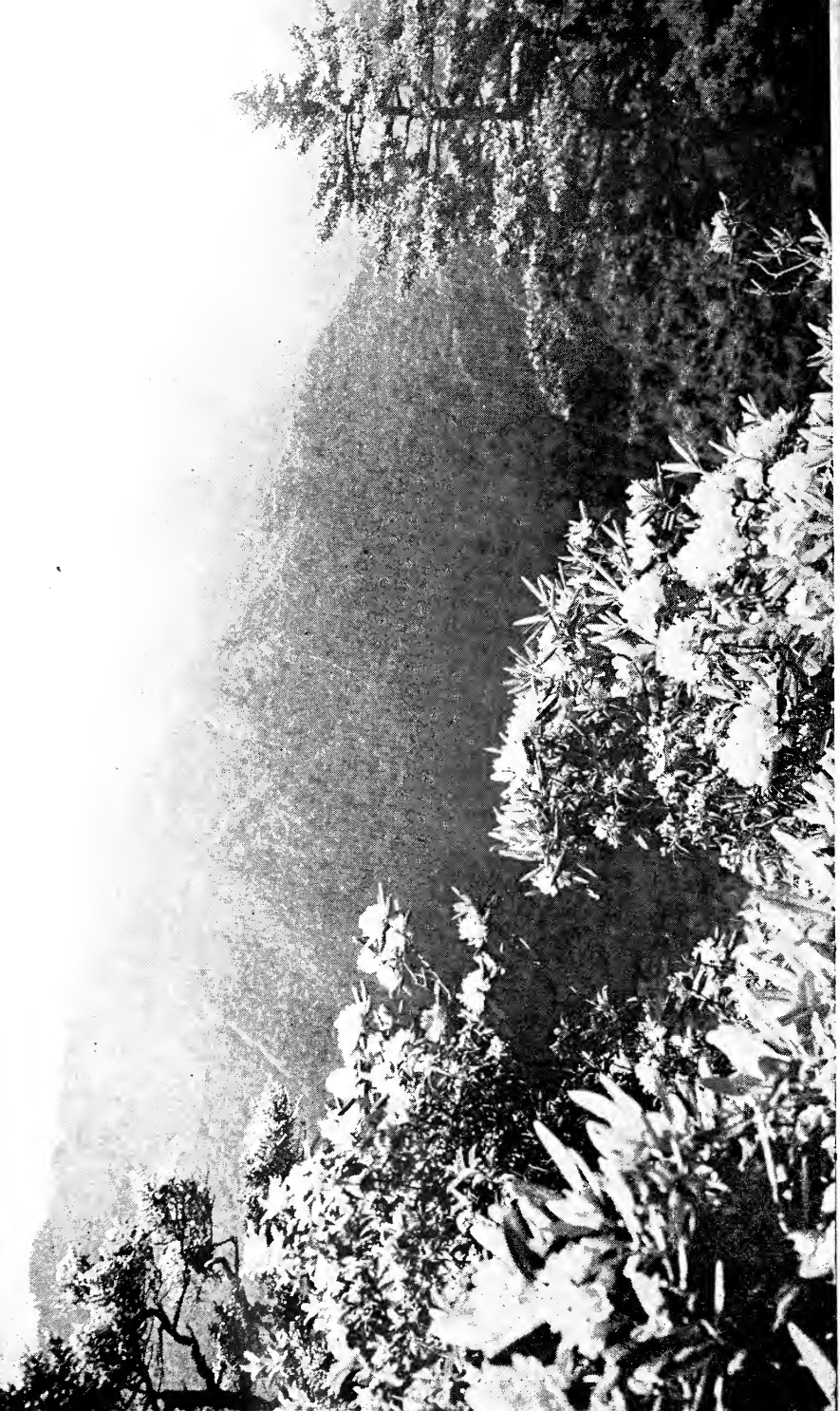
IN THE GREAT SMOKY MOUNTAINS NATIONAL PARK