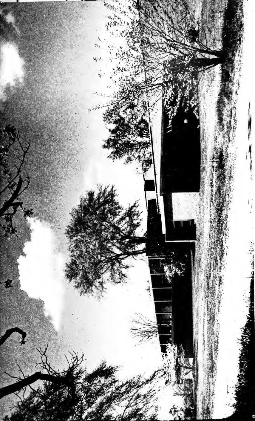
FINE ARTS CENTER