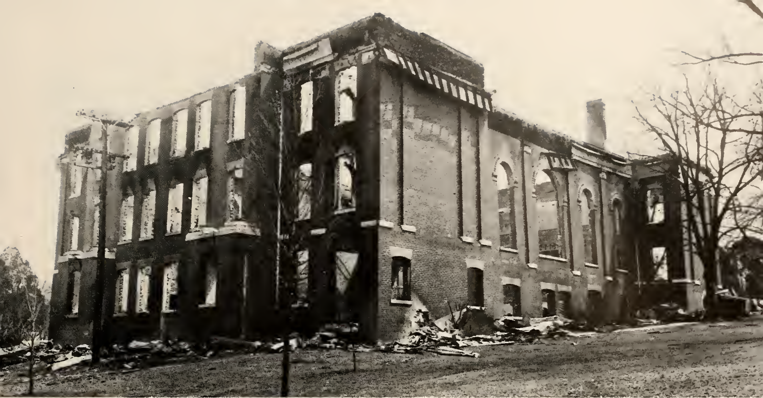
After the Chapel burned and before the walls fell.