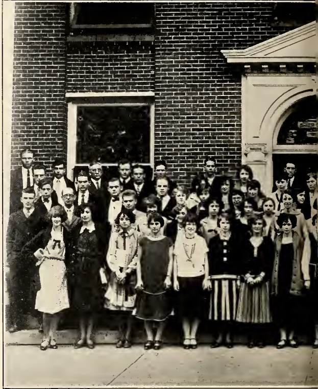
SONS AND DAUGHTERS OF MARYVILLE HAVE TOLD OF T AND DAUGHT

The group photograph printed here is one of the most interesting pictures secured here in many a day. It shows the members of the student body and faculty who are representatives of more than one generation of students at Maryville. This large group is an indication of the abiding faith which the sons and daughters of Maryville have in the College. For a man to attend an institution himself is one thing; for his children and his children's children after him to be intrusted to that same institution during their most critical and formative years is quite another. When graduates and former students in large numbers send their own children to the school they attended themselves they advertise their faith in that school in no uncertain terms. The school must have kept faith with those best qualified to judge it to merit such long continued loyalty. Moreover, it must have kept pace with the times because college men and women do not regard a thing as good enough for their children simply because it was good enough for them, and, unless they feel that an institution is prepared to give their children a training that will equip them for life, a sense of college loyalty is not apt to cause them to send their children to the school.