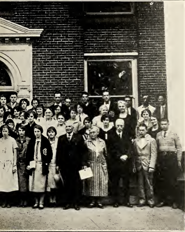
BLESSINGS TO THEIR SONS AND TO THEIR SON'S SONS AFTER THEM