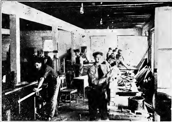
SOME OF THE METHODS OF

All the dormitories are equipped with complete modern sanitary conveniences. Rooms are furnished only as described in the catalog. Students must bring all bedding, except mattress, or be prepared to provide it in Maryville. Students rooming together share the expense of furnishing their room. Very little need be expended in furnishings. Many of the people of Maryville have set aside rooms to be rented to young men students. Unfurnished rooms rent for $5.00 to $7.00 a month. Furnished rooms,