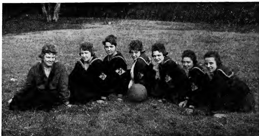
GIRLS' BASKETBALL TEAM