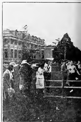
FAMILIAR SCENES OF

attended will be sent upon request. To insure proper classification, this blank, when properly certified, should be sent to the Registrar as early in the summer as possible. Applicants that delay filing entrance certificates until the opening of the year or whose certificates show less than fifteen standard units will be required to take the entrance examinations, September 13 and 14. The first semester begins on Tuesday, September 13, 1921; the second semester, on Tuesday, January 31, 1922.