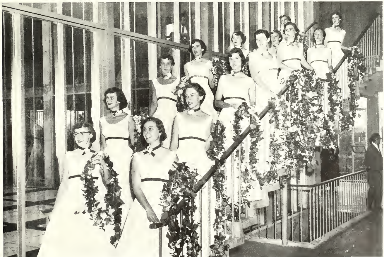
Commencement Scene: The Daisy Chain