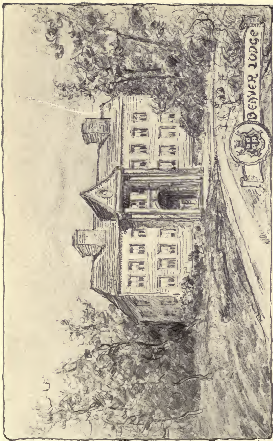
Redrawn from picture furnished by Miss Adele Clark