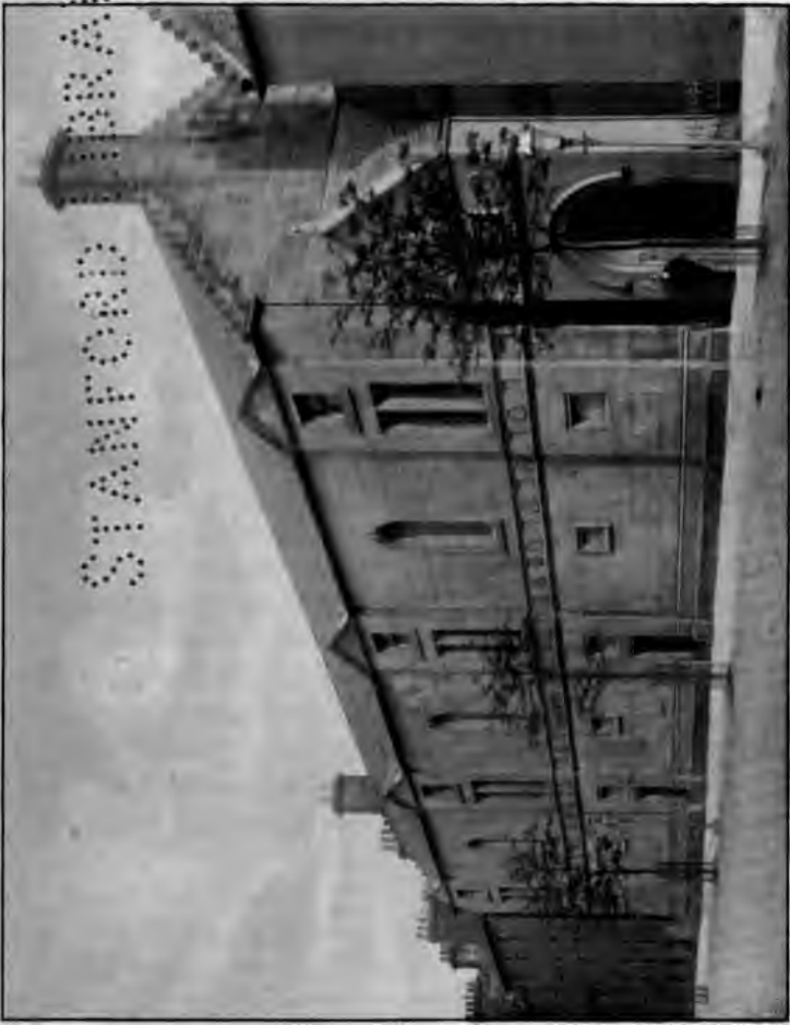
THE UNIVERSITY LIBRARY IN 1891.