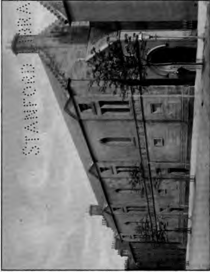
THE UNIVERSITY LIBRARY IN 1891.