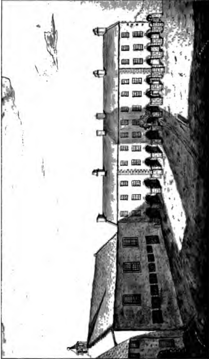
THE UNITED COLLEGE IN 1767.