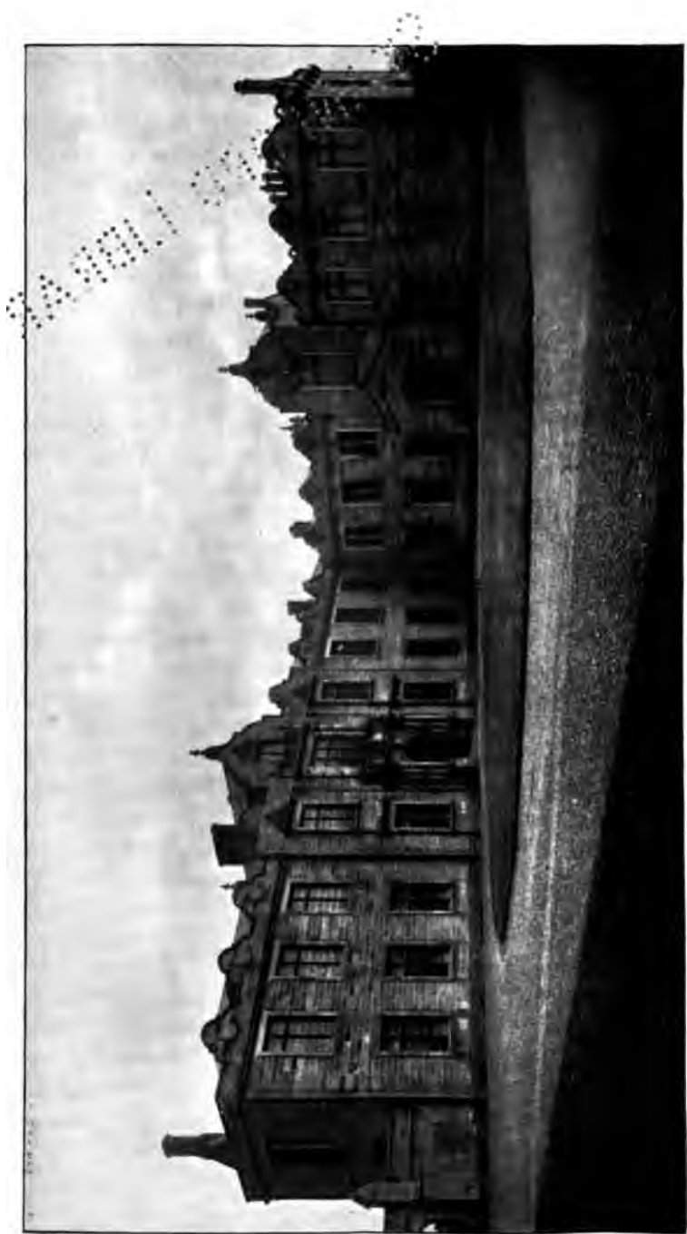
THE UNITED COLLEGE IN 1890.