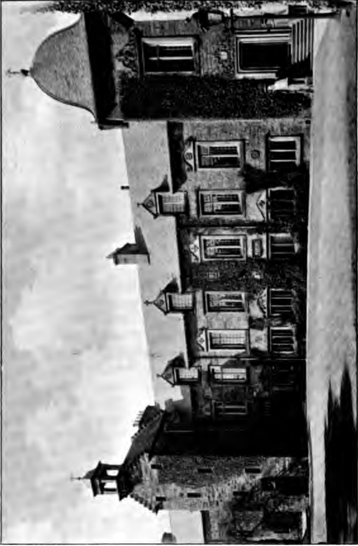
ST. MARY'S COLLEGE IN 1901.