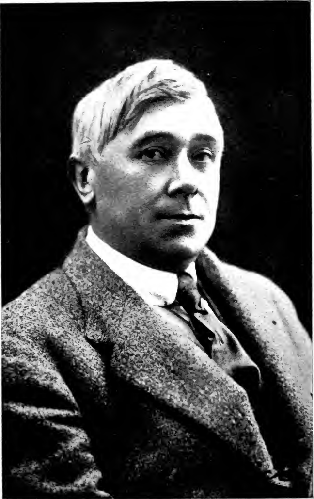
MAURICE MAETERLINCK, 1915.