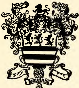
The Arms of the Howland Family