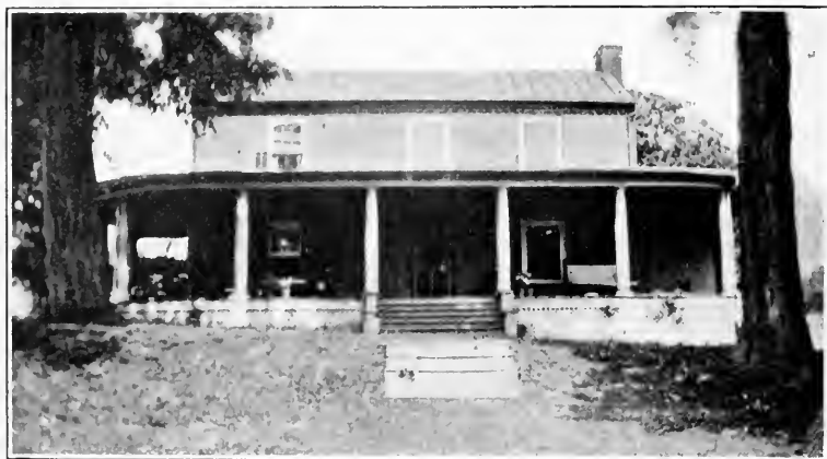
THE McCLURE HOMESTEAD, AUGUSTA CO., VA.