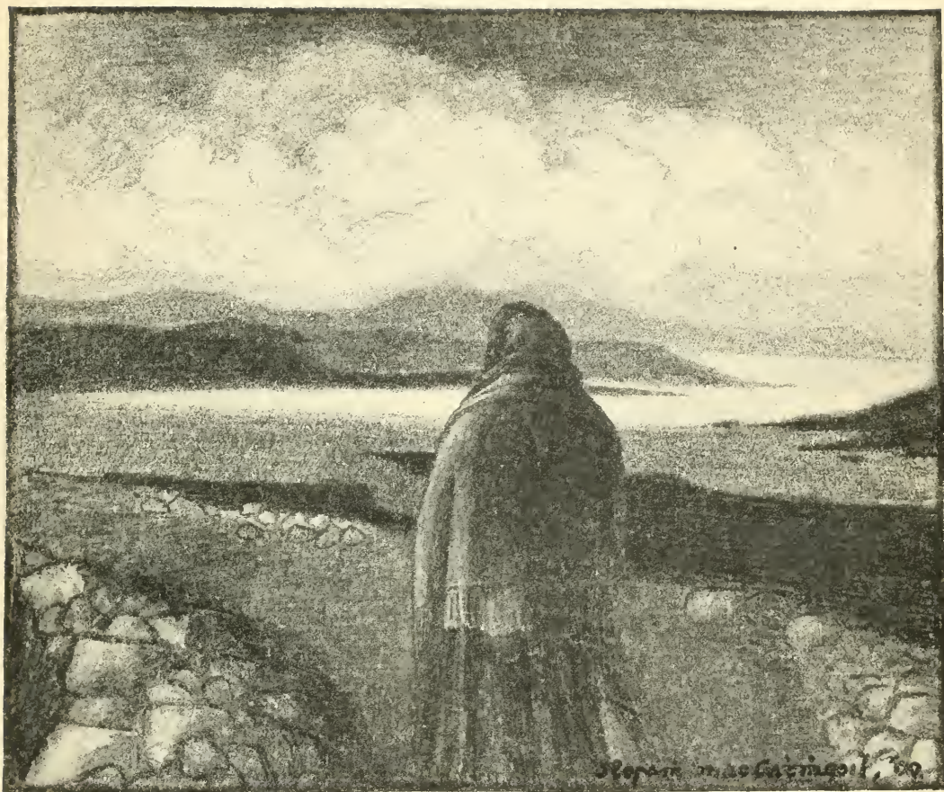
ON THE ROAD TO DOON WELL.