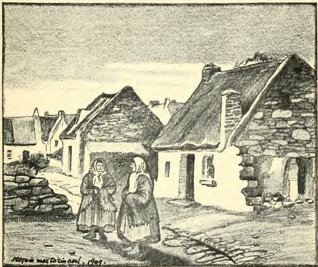
A CLACHAN OF HOUSES.