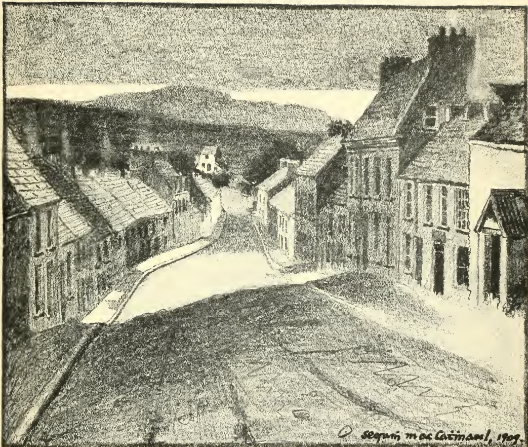
A STREET IN ARDARA.