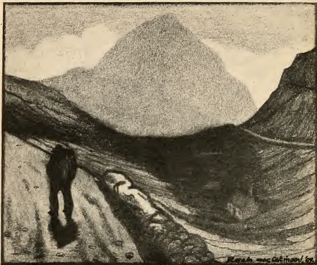
THE WALL OF SLIEVE LEAGUE.