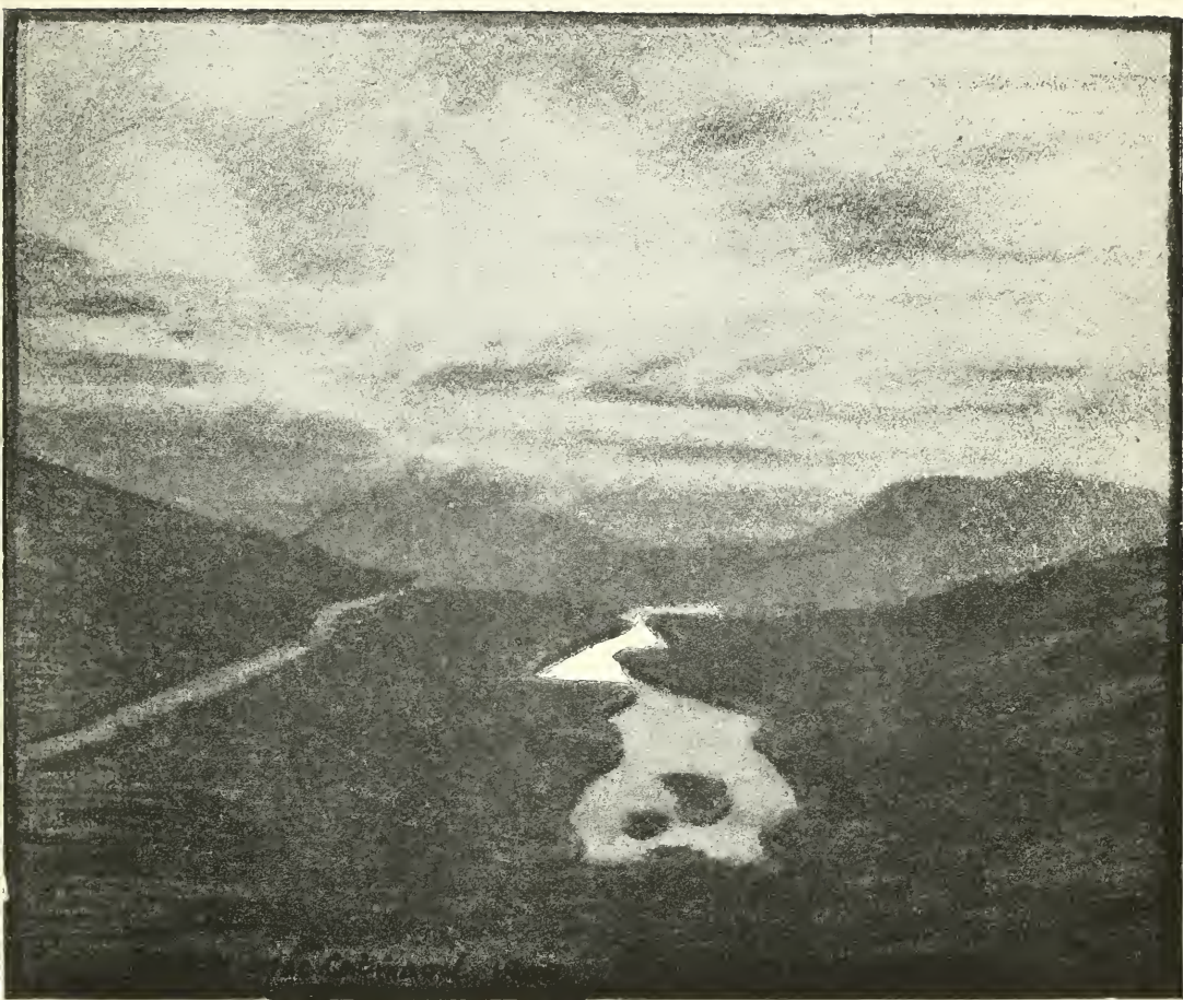
NEAR ALTON LOCH.