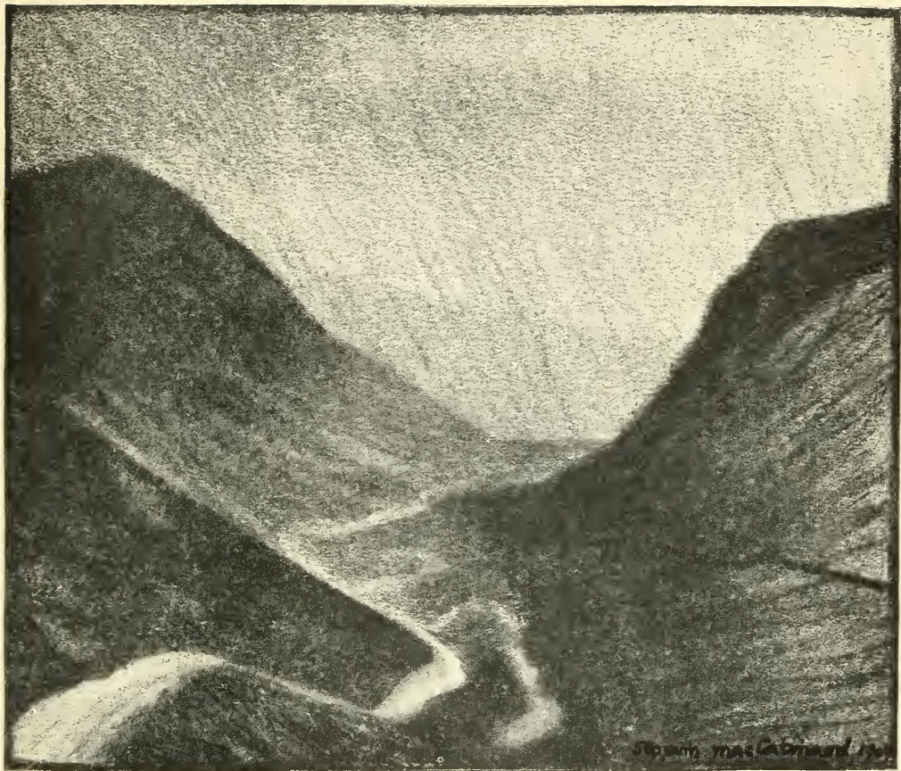
A GAP BETWEEN THE HILLS.