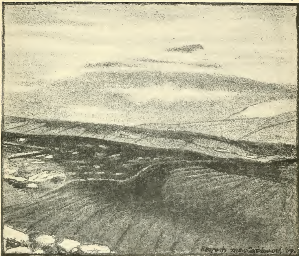
MUCKISH, WITH A 'CAP' ON.