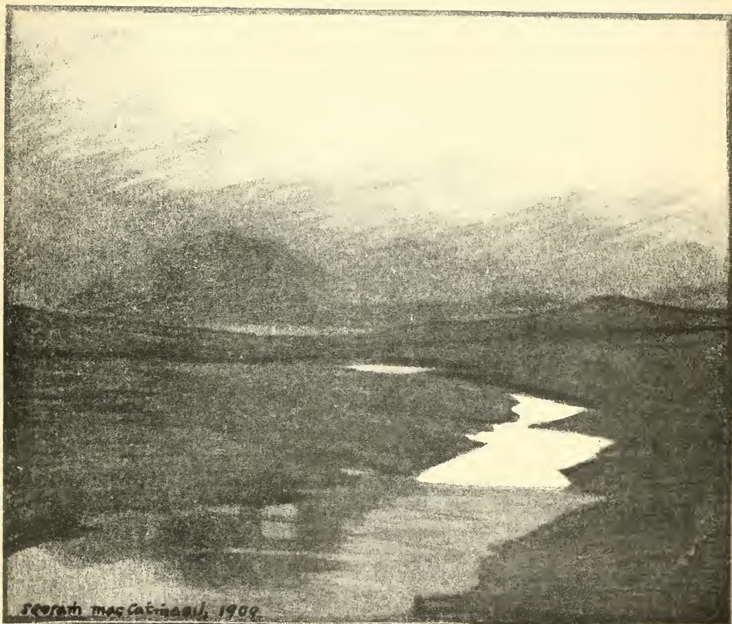
CLADY RIVER, NEAR GWEEDORE.