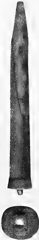
Fig. 6. \frac{1}{2} .

any complete perforation above, which also agrees with the specimens of this nature preserved in the Museum (cf. Fig. 6), whereas none of the alternative construction have been brought over as yet. If this be the case, then we are still without a final conclusion of the discussion regarding Fig. 5. And if I may be permitted to offer a hint, I would suggest that Mr. THALBITZER in his next work should consider the possibility of ice harpoons.