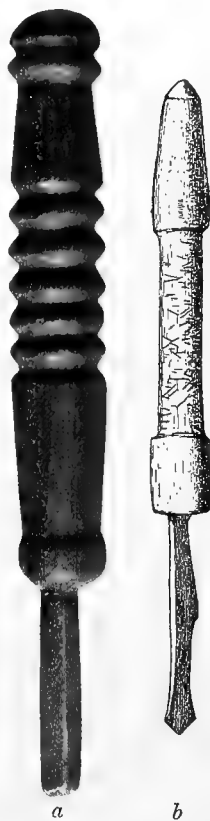
Fig. 2. \frac{1}{2} . (b After F. BOAS: Eskimo of Baffin Land and Hudson Bay fig. 37c).

The Editor might well be unable to see from his photograph, that the "stone" was of iron, he must, however, when actually handling it in the Museum, have given the object but slight scrutiny. Nevertheless, Museum studies apart, he might easily have ascertained the true facts of the case from the book; the piece in question is shown in one of the illustrations in the Danish edition of HOLM's work 2 together with a number of women's knives, and there described as "a whetting iron for