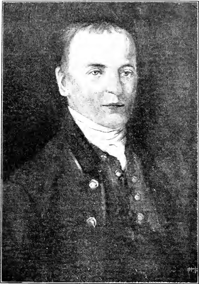
JAMES CRAIK (1730-1814)