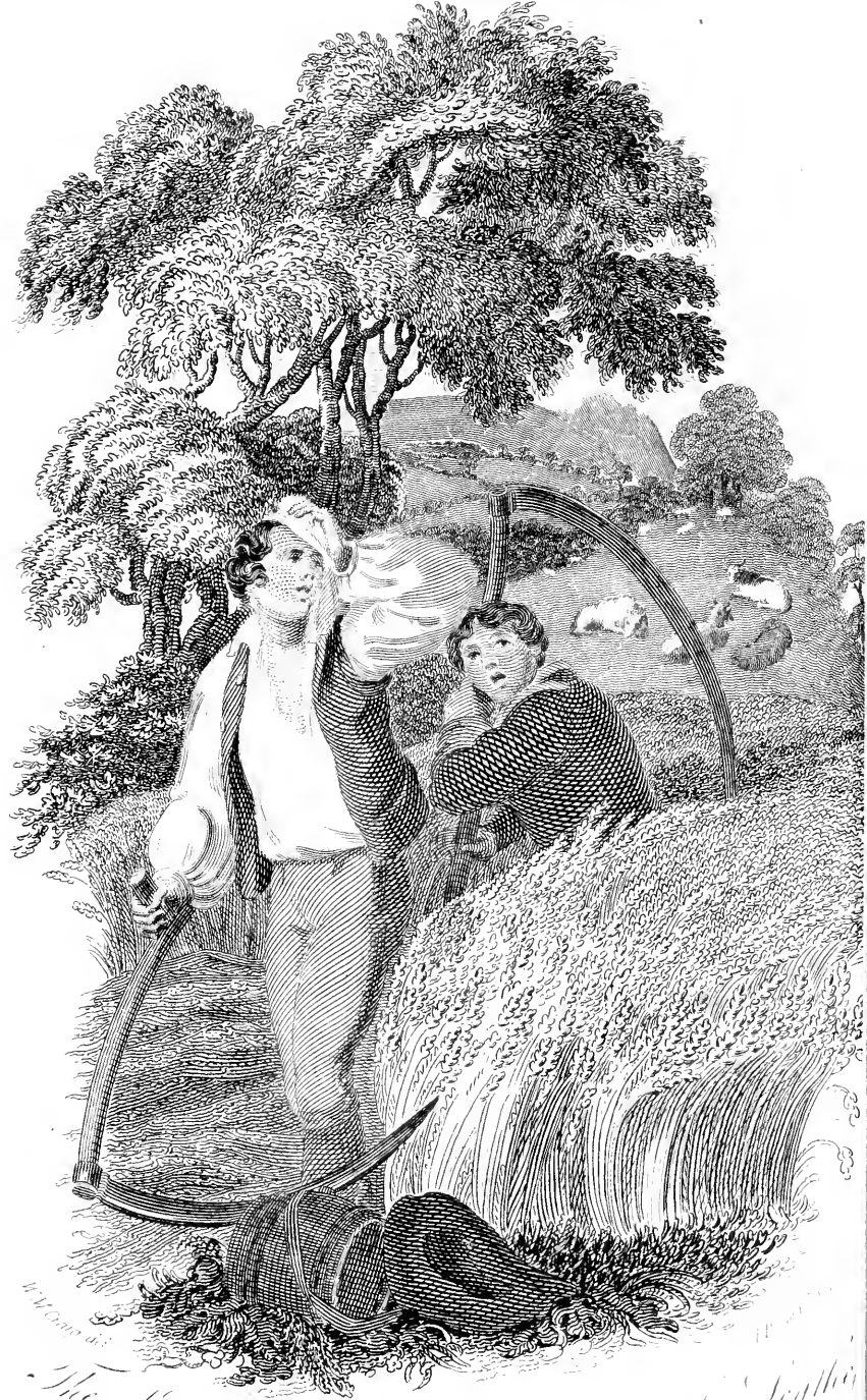
The Laborer's Reward in Sweat, Drops the Sigh