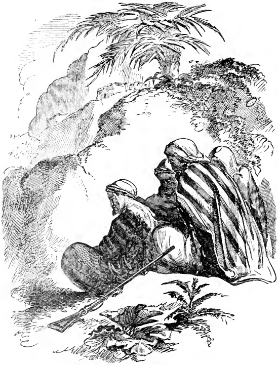
A PARTY OF ARMED MOORS.