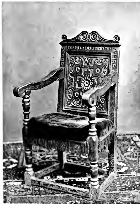
SWIFT COAT OF ARMS AND OLD CHAIR.