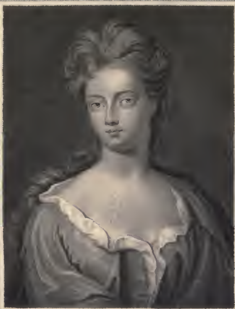
Anne, Countess of Sunderland. Second Daughter of John Duke of Marlborough? From a Miniature in Enamel In the Possession of Earl Spencer.