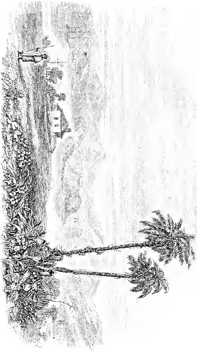
THE BAY OF ISLANDS, NEW ZEALAND.