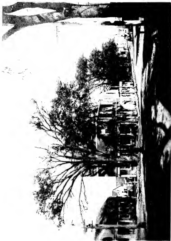
COUNTING-HOUSE OF WILLIAM ROTCH & SONS IN NANTUCKET