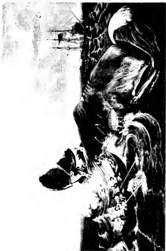
CAPTURING A SPERM WHALE