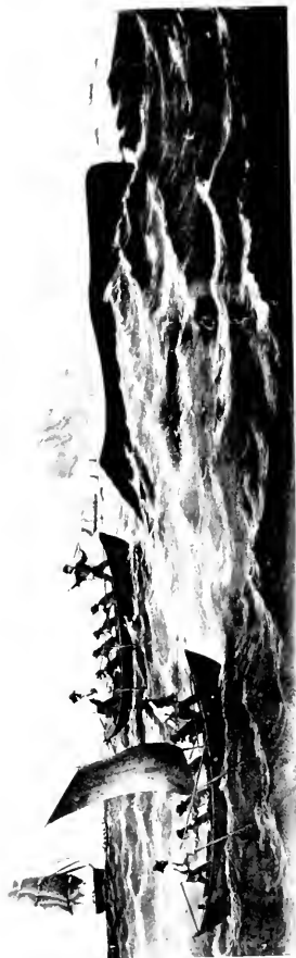
THE CHASE—A SPERM-WHALING SCENE