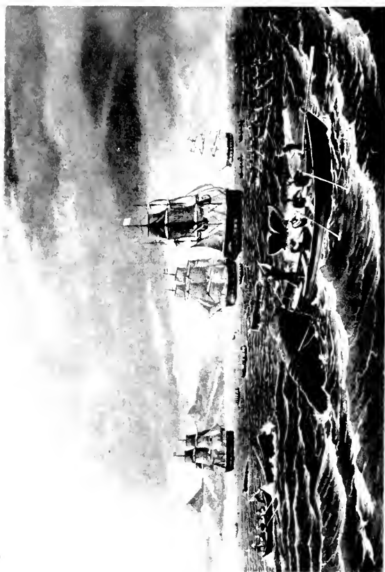
THE ROYAL (ROACH) FLEET OFF THE COAST OF HAWAII