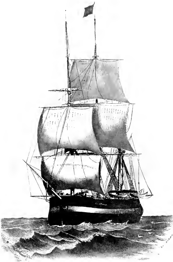
THE SHIP MARIA