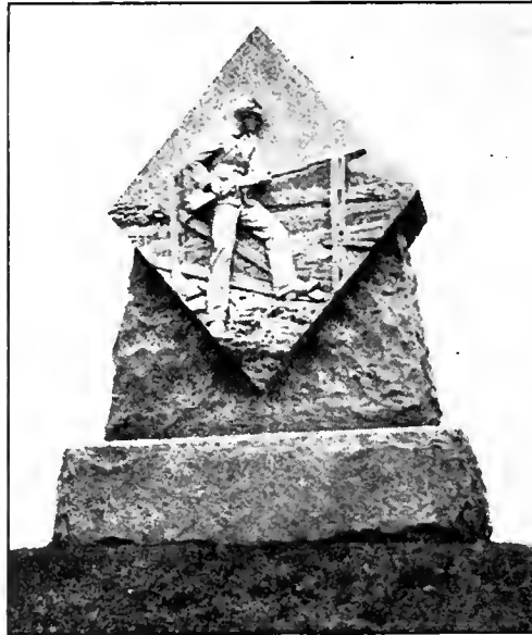
Monument of the First Massachusetts Infantry on the Battlefield of Gettysburg, Pa.